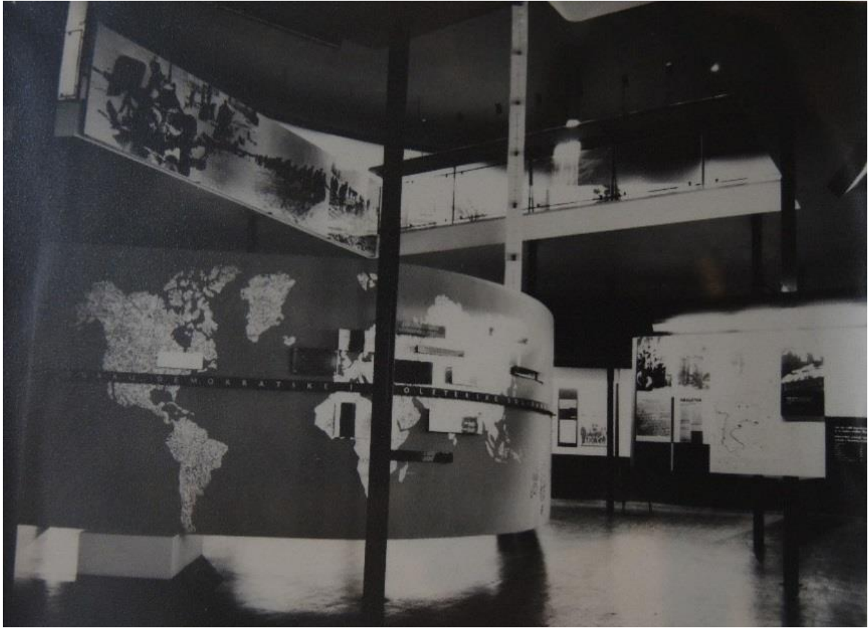
Image 3.1: Permanent exhibition of The Museum of the Revolution of the Peoples of Croatia, circa 1962. The pillar in the middle contained the phrase “workers of the world unite” in various languages.