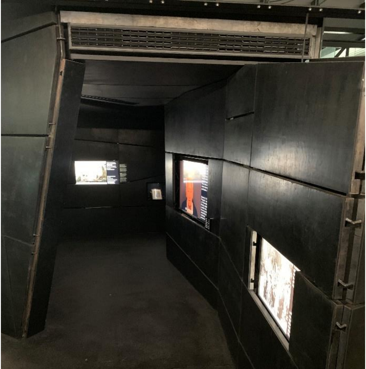
Image 5.2: Permanent exhibition of the Jasenovac Memorial Museum, July 3 rd , 2019.