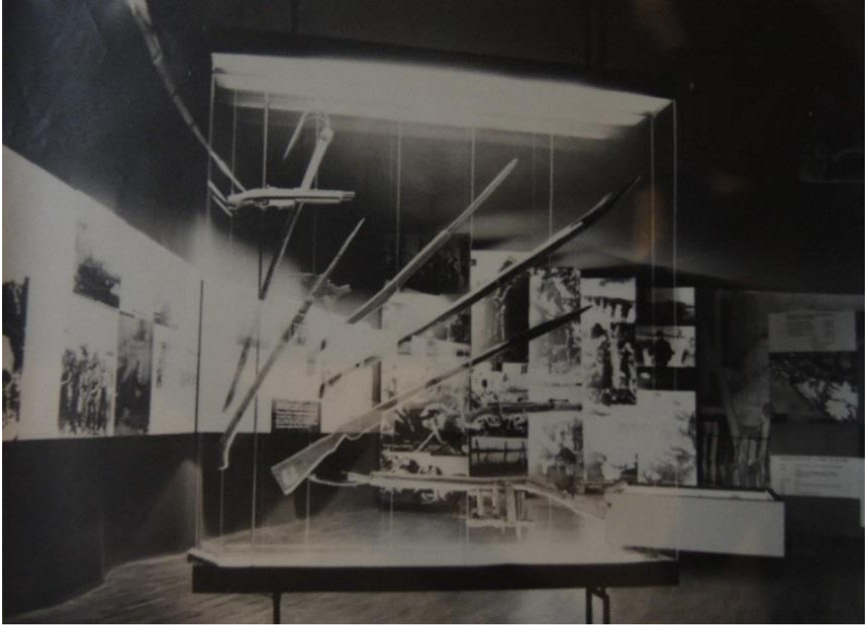
Image 5.3: Permanent exhibition of the Museum of the Revolution of the Peoples of Croatia, circa 1962.