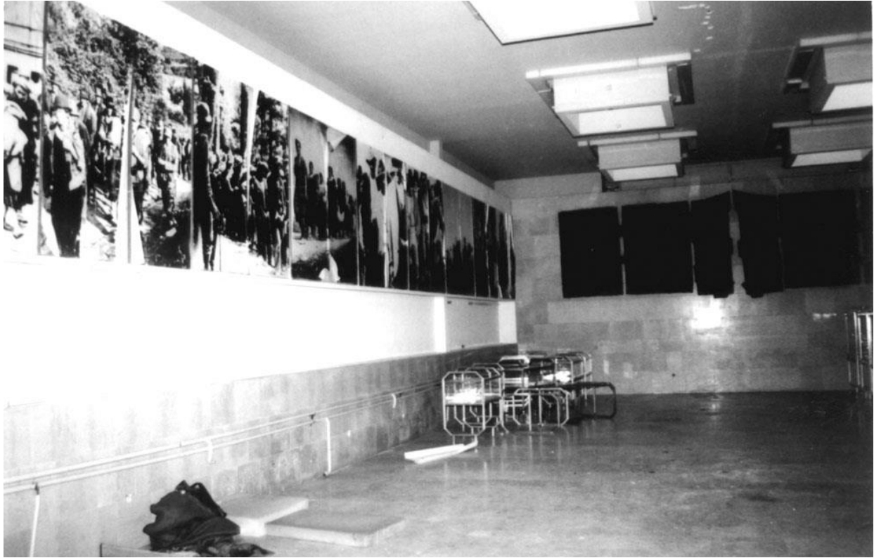
Image 3.5: Permanent exhibition for the Jasenovac memorial museum, circa 1991. This image depicts the state of the exhibition after it had been ransacked by Croatian and Serbian forces. No images of the permanent exhibition in its proper condition are known to exist.