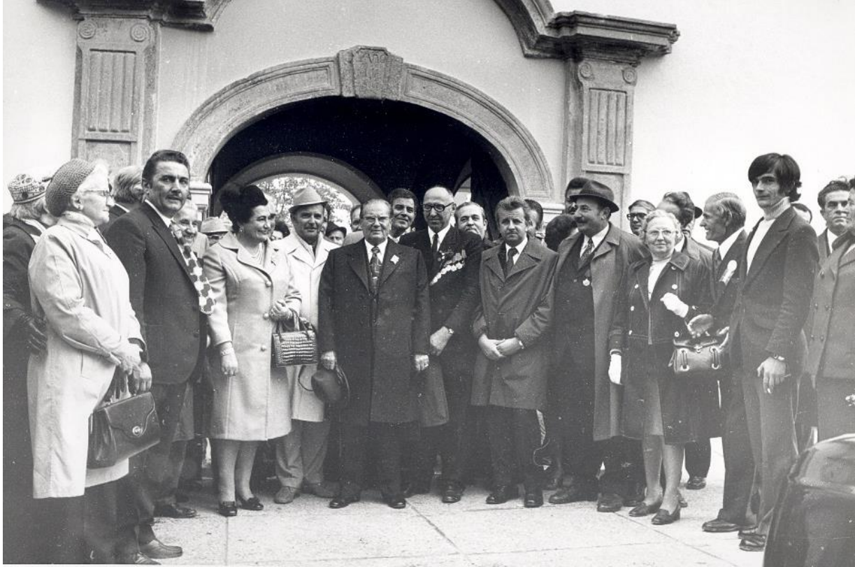
Image 4.1: Josip Broz Tito at the opening ceremonies for the Museum of the Peasant Uprisings, 1973.