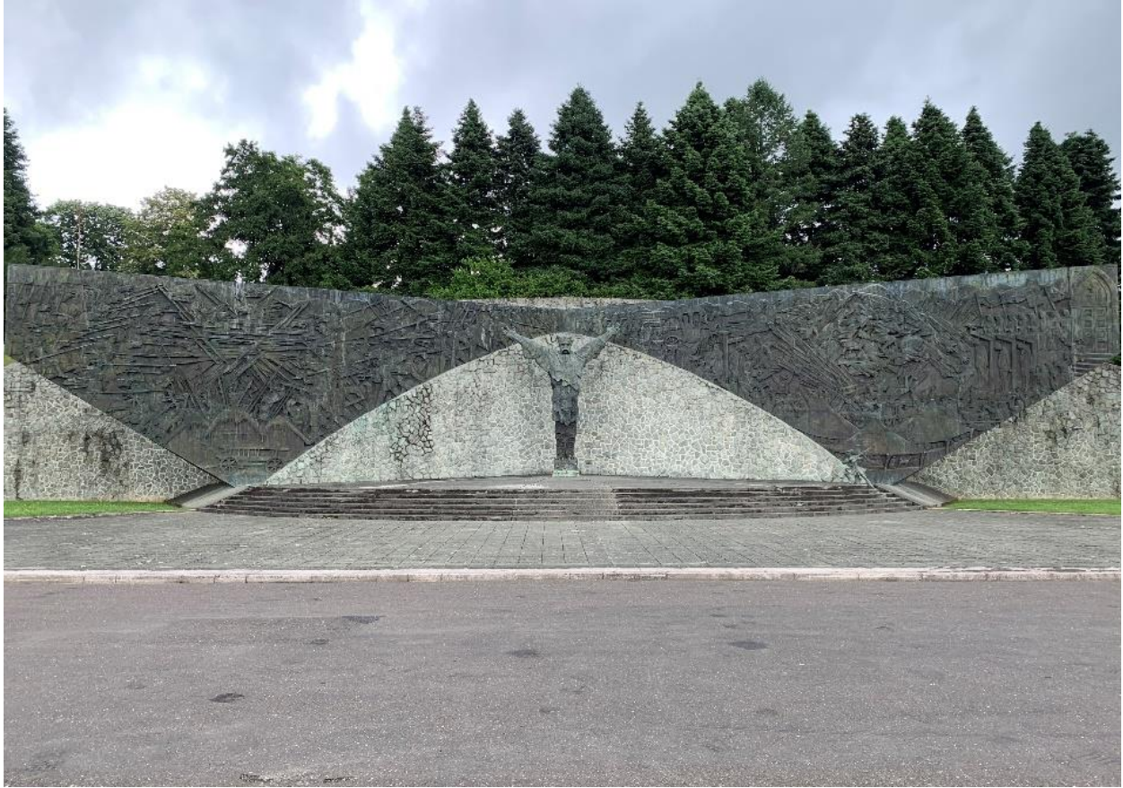
Image 4.2: Antun Agustinčić's statue and mural outside the Museum of the Peasant Uprisings, June 18 th , 2019.