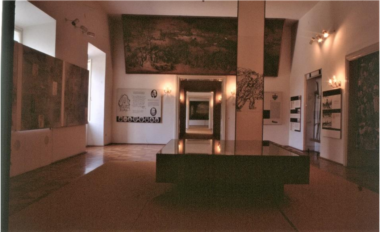
Image 4.3: Interior of the permanent exhibition of the Museum of the Peasant Uprisings, circa 1975. The image is property of the Museum of Peasant Uprisings.