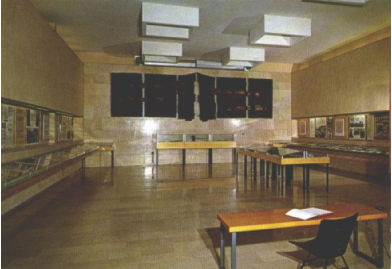
Image 3.4: Permanent exhibition for the Jasenovac memorial museum, circa 1968.