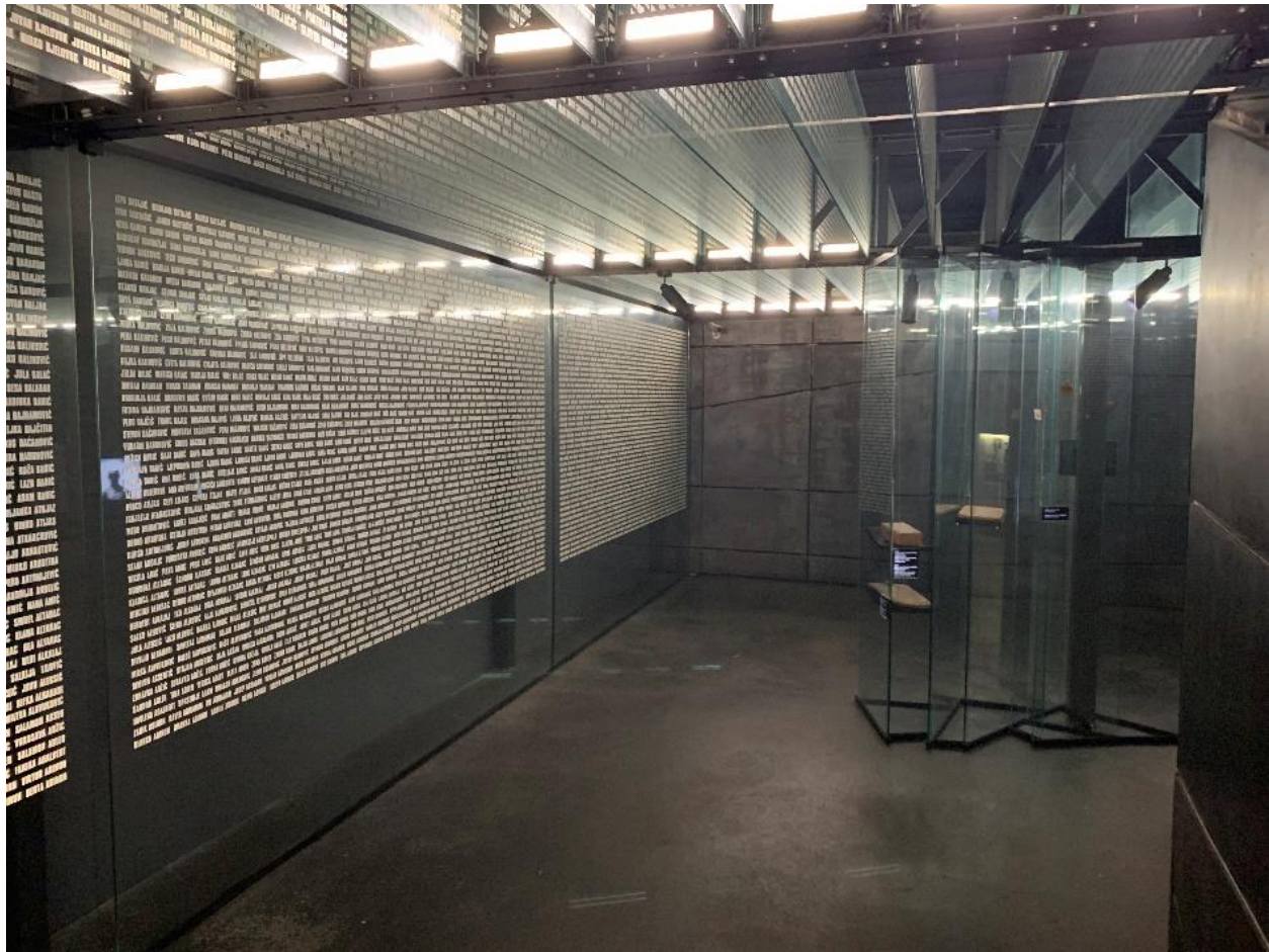
Image 5.1: Permanent exhibition of the Jasenovac Memorial Museum, July 3 rd , 2019.