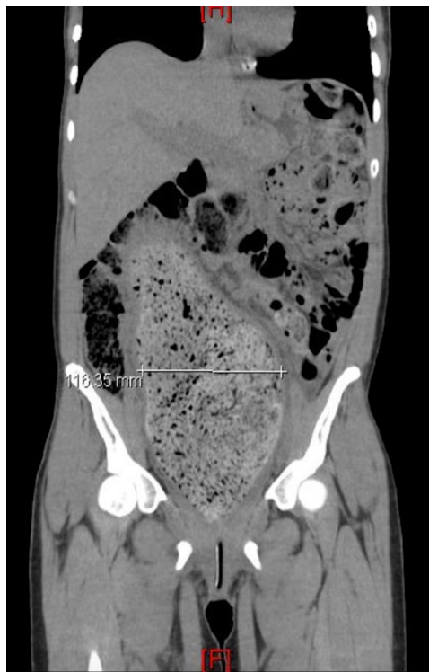
Image 3. Computed tomography of the abdomen in the coronal plane demonstrating a colonic diameter of 116.35 mm at the level of the pelvic brim.