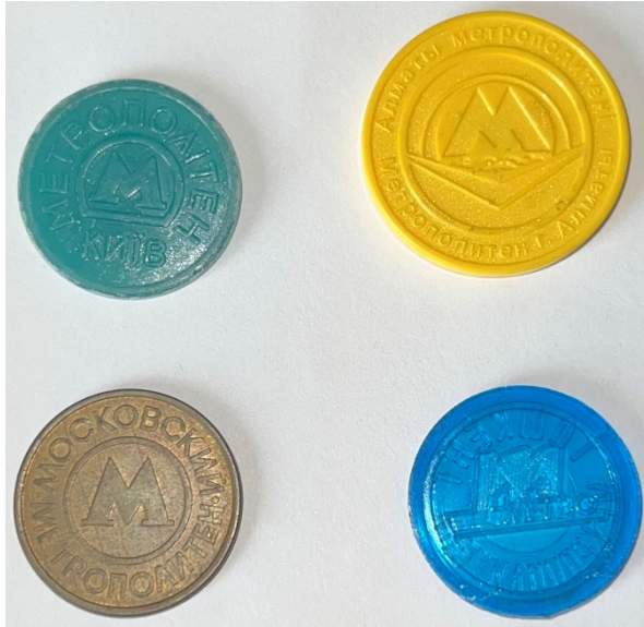
Figure 4. Metro tokens clockwise from top left: Kyiv, Almaty, Moscow, and Tashkent.

However, in the former Soviet Union, token machines are still a common sight, even in conjunction with smart cards. Baku, Kyiv, Minsk, Tashkent, Tbilisi, and St. Petersburg have all accepted transit tokens well into the 2000's, with Yerevan and Tashkent still only accepting tokens as of 2019. In all these cases, the systems were built and opened entirely under Soviet direction, which makes the fact that Almaty utilizes tokens that much more interesting. The Almaty Metro