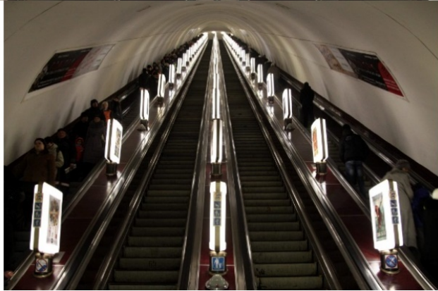
Figure 3. Above: Escalators in the Abay Station in Almaty. Below: Escalators in the Maidan Nezalezhnosti station in Kyiv.

world. 178 One could argue that this logo design is more common than uncommon, so it is no surprise that the Almaty metro uses such a logo. However, the letter type of the M used in the logo, and its explicit use on the token bears a striking similarity to Moscow.