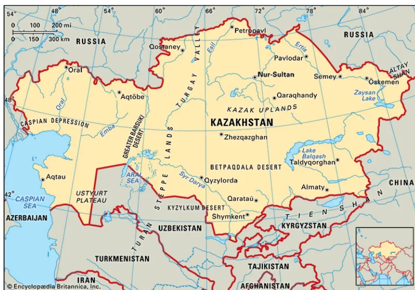
Figure 1. Political Map of modern-day Kazakhstan and its neighbors.

While academic and popular parlance equates Russia with the USSR, the Soviet Union was internationalist from the start. As Perry Anderson notes, it was “the first and only state in history to include no national or territorial reference in its name”. 4 Much of the USSR’s vast territory was located thousands of miles away from Moscow in the five Central Asian republics: Turkmenistan, Tajikistan, Kyrgyzstan, Uzbekistan, and Kazakhstan. While the USSR’s government was based in Moscow, and its territory largely overlapped with the Russian