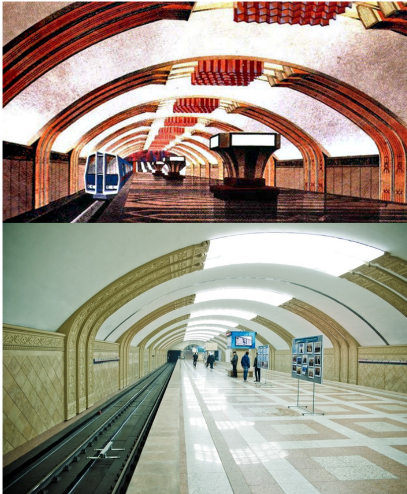
Figure 6. Above: Soviet-era sketch of the Raiymbek station. Below: The finished Raiymbek Station, a deep vault style station.

Despite benefitting from decades of technological and engineering advances, the designs of the Almaty Metro stations followed a similar chronological pattern to that of Moscow's