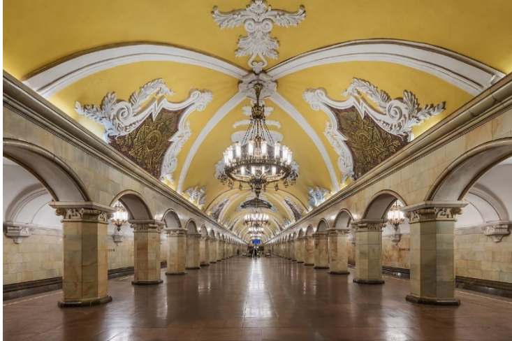
Figure 3. Komsomolskaya Station in Moscow, an oft-cited example of the opulence of Soviet Metro design

In Sotsgorod , Soviet architecture was prescribed to be beautiful by its design, a socialist interpretation of form following function, with Miliutin saying: “An intelligent structural solution needs no covering mask of decoration. A healthy face needs no powder”. 124