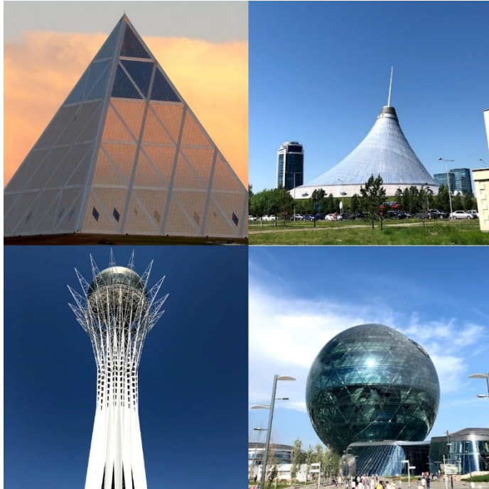
Figure 2. Clockwise from left: The Palace of Peace and Reconciliation, The Khan Shatyr mall, Baiterek Tower, and the 2017 Astana Expo.

or historic ties to, Nazarbayev elected to simply build a new city that would reflect his goals for what Kazakhstan should be. 68