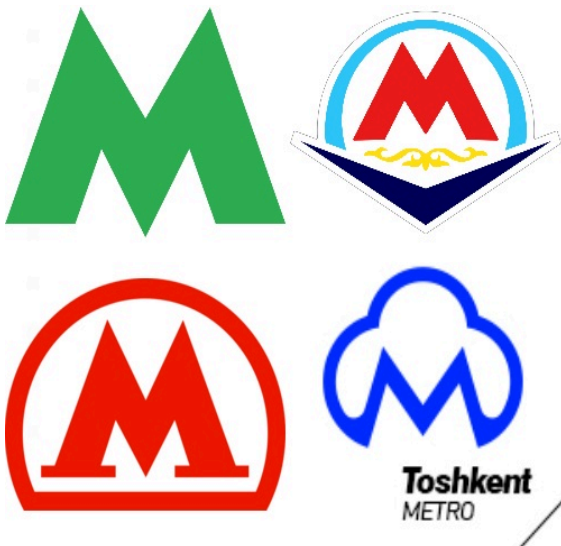
Figure 5. Metro logos from top left: Kyiv, Almaty, Moscow, and Tashkent.

also uses a smart card, called "Smart Card" in Russian and not Kazakh. There seems no explanation for Almaty's use of tokens other than an enduring mindset from senior engineers and planners left over from the Soviet Union. Metro engineers were clearly aware of smart card