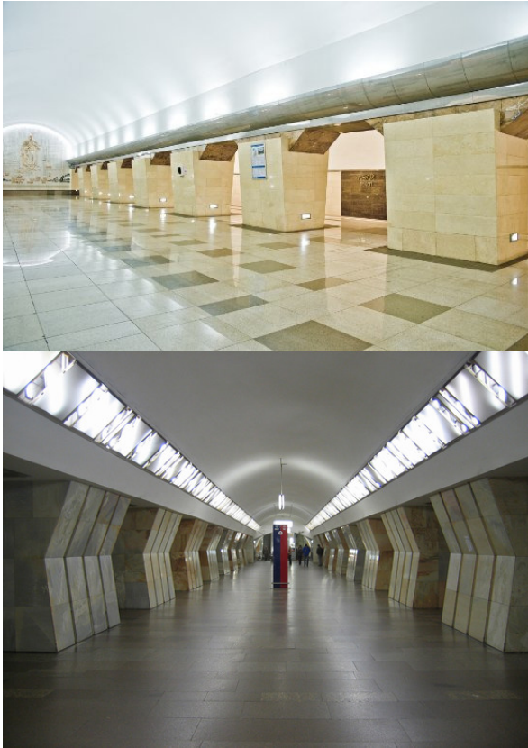
Figure 5. Above: Abay Station in Almaty. Below: Sukharevskaya station in Moscow. Both are deep column stations.

large central halls, with either large columns or large pylons separating the main hall and the track. 181 These stations were the most common in the Moscow Metro's early days 182 , as they were the easiest to construct deep underground with the technology at the time. In 1938 a demonstration of new station architectural possibilities opened. The Mayakovskaya station of the Moscow Metro is the world's first example of the deep column station, where instead of massive and costly pylons, steel columns were used to support the large underground structure. 183 The last and least common of the Soviet designs that is exhibited in