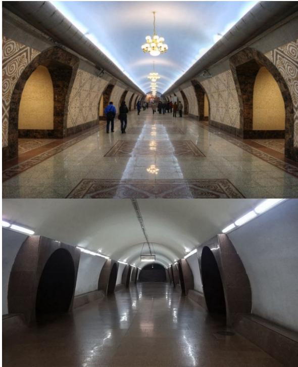
Figure 4. Above: Almaty Station in Almaty. Below: General Andranik Station in Yerevan. Both are deep pylon stations.

though for safety and efficiency reasons they run slightly slower now, still often faster than western counterparts though. 180