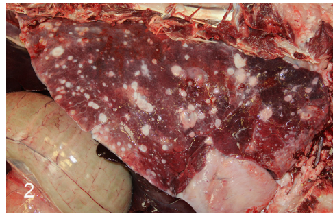
Fig. 2. Dam's lung showing widespread, multifocal, granulomatous pneumonia caused by Coccidioides spp.

A serum sample obtained from the dam at the time of the abortion was tested at the coccidioidomycosis serology laboratory at the University of California, Davis. The serum was positive for coccidioidal IgG antibodies by qualitative immunodiffusion (in-house assay) and the titer determined by quantitative immunodiffusion (in-house assay) was 1:256, which is interpreted as an indicator of disseminated coccidioidomycosis. The dam was euthanized. A postmortem examination and histopathology revealed disseminated coccidioidomycosis severely affecting the lungs (Fig. 2) and serosal membranes of the thoracic cavity, and mildly involving other organs such as the liver, kidneys, and uterine neck and horns. Fungal spherules similar to those described for the fetus were scant and were only seen within a few of the pyogranulomas in the lungs and liver, but were not seen within the pyogranulomas of the kidneys or uterus. The dam was seropositive for bluetongue virus by a cELISA (VMRD Inc.) and seronegative for Brucella abortus by diagnostic card test (National Veterinary Services Laboratories), bovine viral diarrhea virus type-1 and 2 by serum viral neutralization