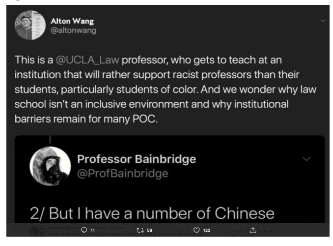
Figure 4: Tweet posted by Alton Wang in response to Stephen Bainbridge blocking him on April 10, 2020

Figure 3: Tweet posted by Alton Wang in response to Stephen Bainbridge's April 6 Tweets