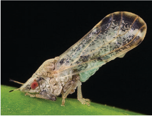
UC researchers are pursuing a number of approaches to limit the spread of Asian citrus psyllid (above, feeding). By keeping populations low, they hope to limit the chances of psyllids picking up the huanglongbing pathogen.