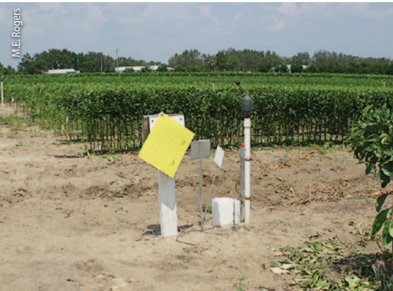
In addition to careful visual monitoring for all stages of Asian citrus psyllid, yellow sticky cards can be used to detect adults.