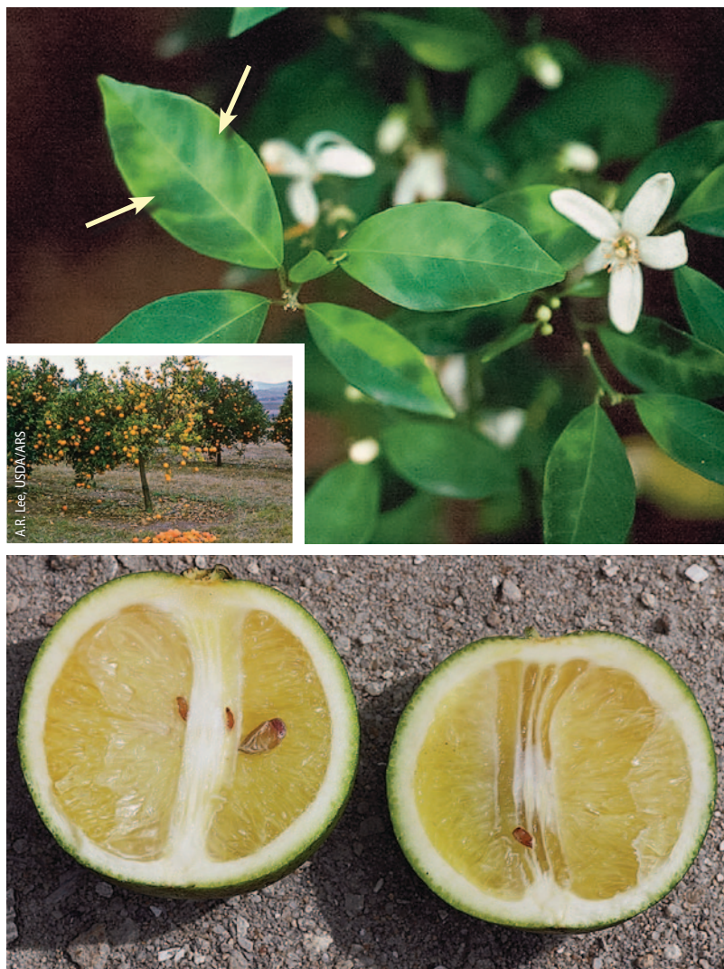
Leaves with huanglongbing symptoms, top . Note the yellow areas to one side of the midveins and the dark green areas directly opposite. Citrus trees with the disease often have, top inset , excessive and premature fruit drop, or, above , citrus fruits that are small, hard and misshapen or have rinds that do not color properly. Such symptoms may not show up in the tree for a year or more after infection. Research is under way to detect the disease earlier so that infected trees can be removed.

Cristina Davis, professor in the UC Davis Department of Mechanical and Aerospace Engineering, and Abhaya Dandekar, professor in the UC Davis Department of Plant Sciences, are refining a mobile chemical sensor that can rapidly discriminate between healthy and diseased citrus trees by sniffing their volatile organic compounds (VOCs). The researchers collected samples of VOCs emitted from trees infected with huanglongbing disease in Florida every month for a year in order to train the mobile sensor to recognize its smell. "The idea is to extract a group of compounds that creates the signature for the