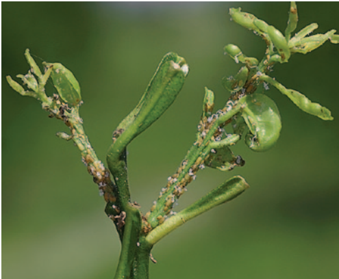
When psyllids feed on citrus leaves, the leaves become distorted and malformed. Psyllids extract large amounts of sap from trees and produce honeydew, which can cause sooty mold.