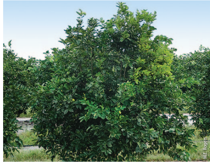
Asian citrus psyllid carries the vector of huanglongbing disease, also known as citrus greening. One symptom of the disease is mottling and chlorosis of leaves.

But that doesn’t mean UC researchers and UC Cooperative Extension specialists and advisors are