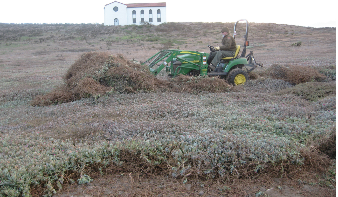
FIGURE 4 (top). Lobo Canyon on Santa Rosa Island in 2018 showing vegetation regrowth after the stream was declared “non-functional” in 1995 and the cattle were removed two years later. LARY M. DILSAVER