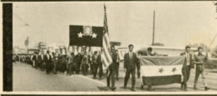
Porterville farm workers march in memory of U.A.R.'s Nasser.