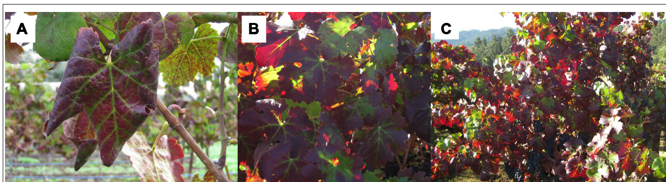
FIGURE 1 | Leaf symptoms of grapevine leafroll disease include inter-veinal reddening and leafrolling in red-fruited varieties. Symptoms are most pronounced around the harvest period. These photographs were taken in the fall (September) in Napa, CA, USA. Photographs show symptomatic leaf ( A ), group of leaves ( B ), and whole plant ( C ).

Both groups of GLRaV ampeloviruses, like other species in the Closteroviridae, are filamentous virions with a large (13–18 kb) positive-sense single-stranded RNA genome (Fuchs et al., 2009; Martelli et al., 2012). However, there are important differences in genome structure between the groups. The genomes of GLRaV-4-like species are ~5 kb smaller and lack several open reading frames on their 3' ends that are present in GLRaV-1 and -3 (Thompson et al., 2012). Despite the large genetic diversity among GLRaV species, little is known about the phenotypic variability in disease symptoms among or within species. One careful study of GLRaV-2 demonstrated that disease symptoms were associated with the phylogenetic clustering of variants (Bertazzon et al., 2010), but similar work has not been performed with other viruses. Despite this gap in knowledge, GLRaV-3 has emerged as the key species causing GLD worldwide. The reasons behind the prominence of GLRaV-3 are poorly understood, especially because other GLD-causing species also co-exist with GLRaV-3, often within one vineyard or plant (Sharma et al., 2011), and some can be transmitted by the same vector species (Le Maguet et al., 2012). Notably, GLRaV-3 has been identified as the main species