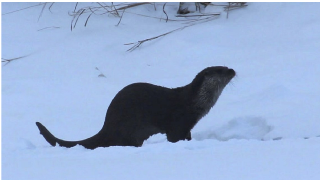
Figure 3. Otter observed at the Numrug River in Eastern Mongolia, November 28, 2012