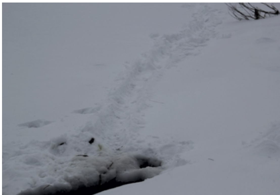
Figure 2. Otter tracks between two ice holes, Numrug River, November 29, 2012.