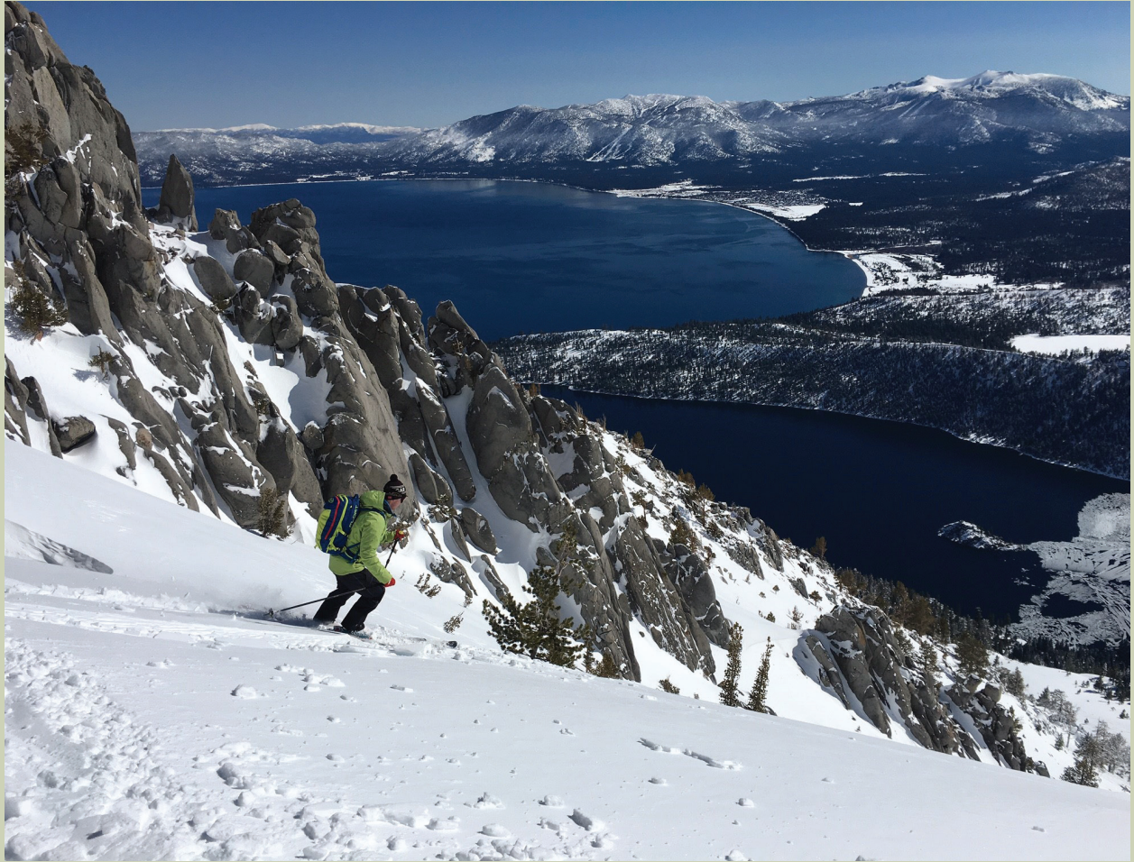
Enjoying the unique geodiversity of Lake Tahoe, California, USA.

Lake Tahoe is the largest alpine lake in North America, the second deepest, and is second only to the Great Lakes as the largest by volume in the United States. It is prized as a geoheritage wonder for the stunning clarity of its waters and the granodiorite mountains that rim the basin. The effects of climate change, however, are accelerating changes to the hydrology and aquatic and upland ecosystems, and are profoundly altering this national treasure. The Lake Tahoe Basin has annual visitation similar to that of a national park, but over 65,000 year-round residents also live within its borders. This combination makes it an intense testing ground for California's ability to adapt to climate change, as small communities and road networks are intimately woven throughout the basin's spectacular waters, mountains, and forests.