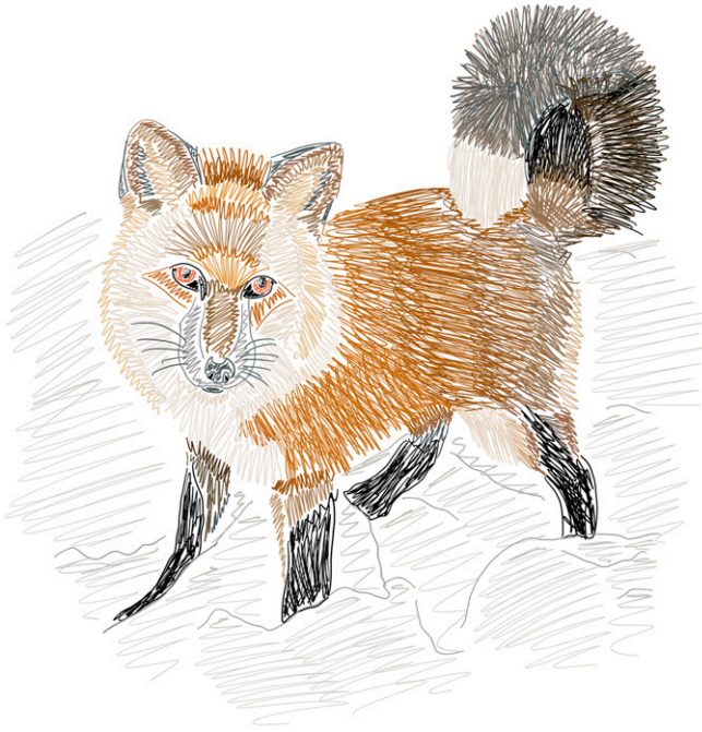
Figure 1 Illustration of a tame fox by Carla Ladd based on a photograph from Irina Pivovarova. See cover image of the March issue of G3 ( https://www.g3journal.org/content/8/3.cover-expansion ).

is called a skulk!) They found that the kits' behavior correlated with that of their genetic parents, rather than that of their foster mother (Trut 1980; Trut 2001; Trut and Dugatkin 2017). This suggests that nurture has less influence on fox kits' tameness or aggression than does their genetic make-up. Thus, tameness is a highly heritable trait, and it is reasonable to search for the genes that underlie it.