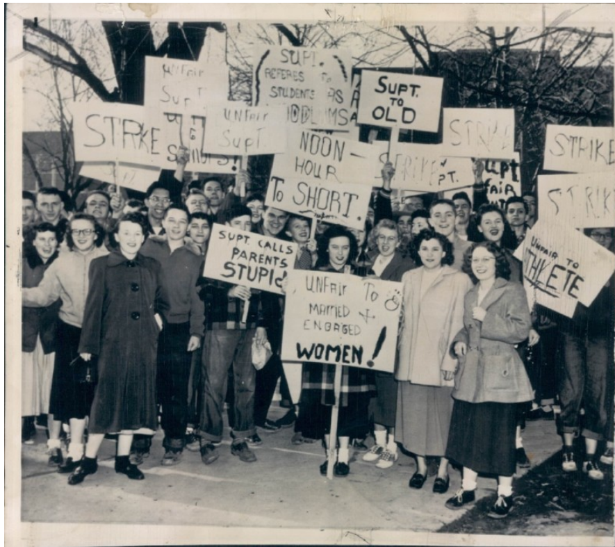
Figure 2 - Students Protest Outside Mount Morris High School, 1951.

When word of the expulsions got out, the senior class erupted in protest. Nearly the entire senior class and a few recruits from other grades went on strike in protest. They paraded around the school's grounds holding homemade signs. One read "Unfair to Married and Engaged Women!" Another sign drew attention to Clark's disrespect for the students: "Superintendent Refers to Students as Hoodlums." A third sign – "SUPT. TO OLD" – expressed frustration with the growing generation gap between the students and Clark, though the poor spelling suggested the protesters still had a few things to learn from their elders.