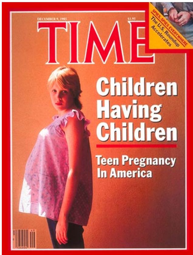
Figure 3 - Time Magazine Cover, 1985.

Perhaps the most iconic was the cover of the December 9, 1985 issue of Time magazine. It showed a white, blond girl standing sideways in a frilly pink top. She exudes youthfulness in nearly every way, aside from her large, protruding belly. She looks at the camera with a slightly weary look on her face, and