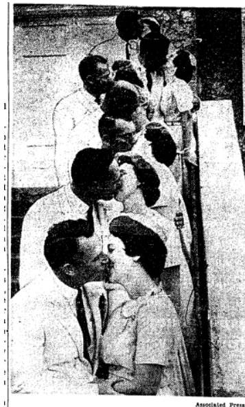
Figure 1 - Group Wedding in Star City, Arkansas.

In many cases, revamped marriage laws helped cut down on youthful elopements. But in other cases, new legislation simply altered the geography of elopement, closing down old marriage mill towns as new ones arose to take their place. In the Midwest, Crown Point, Indiana dominated the out-of-state marriage business during the 1930s. But after Indiana passed legislation in 1940 requiring blood tests, the marriage boom moved west to Iowa, where girls of fourteen and boys of sixteen could marry with parental consent, and without a waiting period. By 1961, Iowa county clerks reported that half of all marriages performed were for out-of-state juveniles. Each border town catered to a different population: Chicagoans went to Clinton and Davenport, Wisconsinites headed to