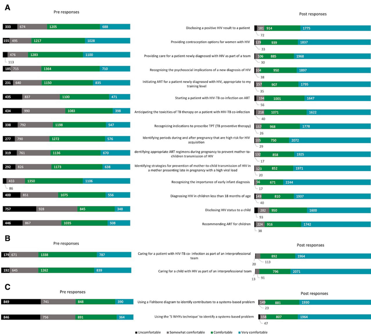
Figure 1 Prelearner and postlearner assessments of confidence (A) clinical confidence, (B) confidence engaging in interprofessional collaboration and (C) confidence using quality improvement tools. ART, Anti-Retroviral Therapy; TB, tuberculosis; TPT, Tuberculosis Preventive Therapy.

gender, cadre and stage of training. Notably, there was a small but significant diminution in scores between the post-test assessment immediately after the course, and then >6 months later, across all training content and