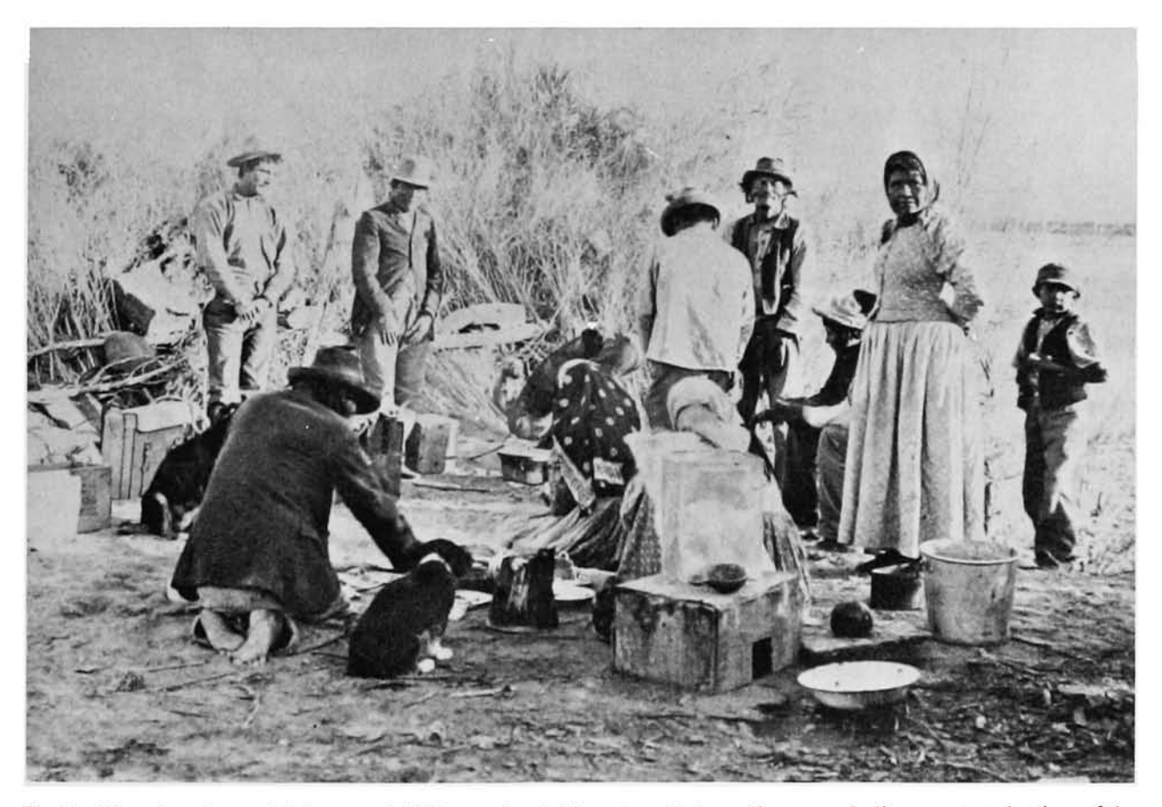
Fig. 2. Chemehuevis, probably around 1890, wearing "citizen dress." According to an Indian agent at the time of the Calloway Affair, "The Chemehuevis are intelligent and industrious, wearing civilized costume from hat to shoes, used to supporting themselves and well worthy of aid and encouragement" (Biggs 1880). The scene is a temporary camp along the Colorado River, location unknown, "in the winter time because the water is so calm," according to informants.

After the Calloway Affair, there were three more "war scares," in 1885, 1889 and 1897, which, like the Calloway Affair, seemed to follow the long tradition of Chemehuevi-