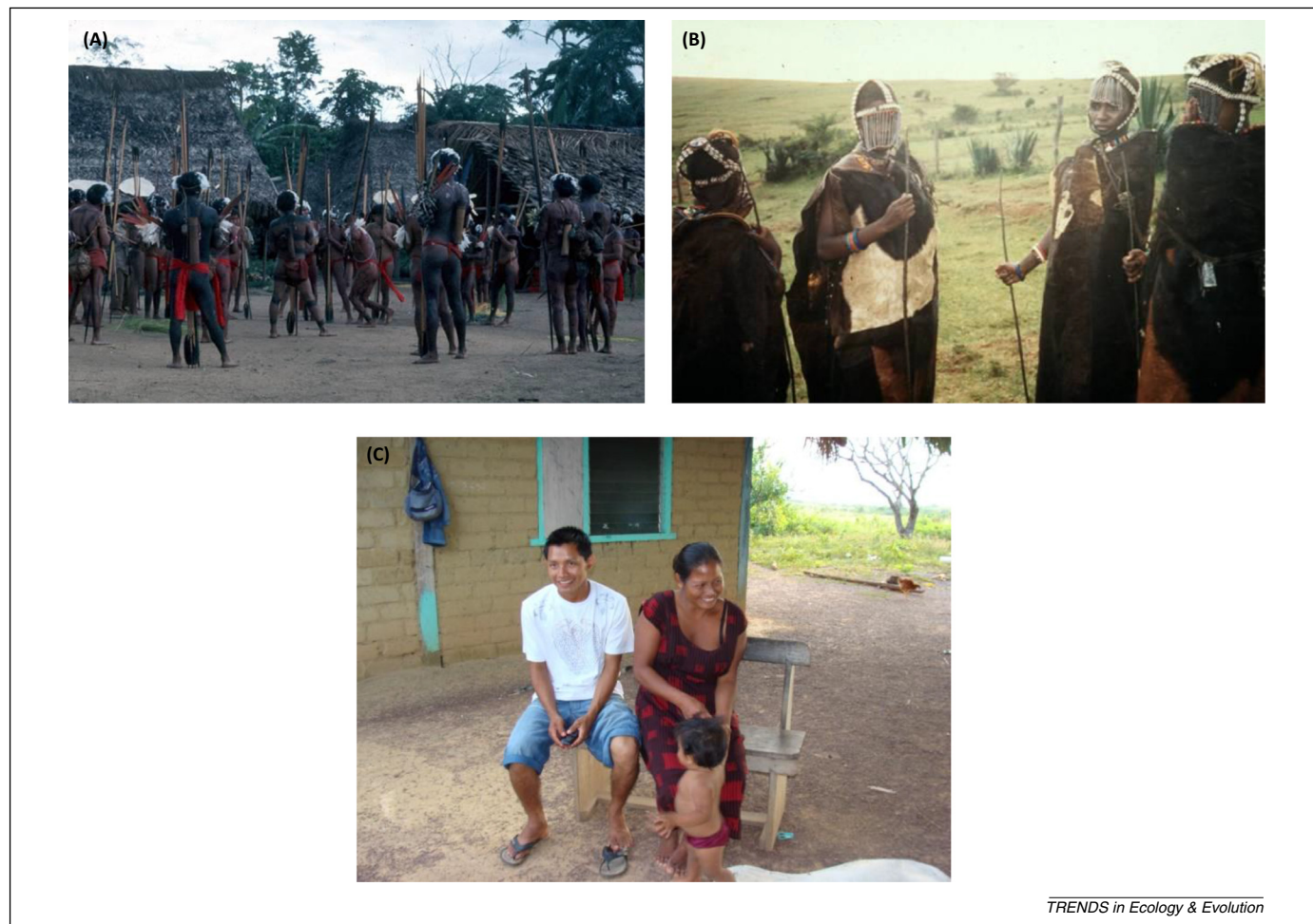
Figure 1. Examples of mate acquisition strategies in humans. (A) Among the Yanomamö of Venezuela, men engage in violent contest competition (intervillage raids) to secure mates for polygynous unions; successful warriors have multiple wives [58]. (B) The Kipsigis of Kenya also practice polygyny, but men engage in scramble competition to secure the resources that attract newly initiated young women; men with more resources acquired through trade, theft, and inheritance are those with multiple wives [59]. (C) Among the Makushi of Guyana, monogamous marriage is the most common type of union; because men perform brideservice (grooms work for brides' families to marry) and postmarital residence is matrilocal (a groom lives with his bride's family), success entails securing a single long-term mate [60]. As is evident from these three examples, not all mating competition is violent and not all mate acquisition strategies enhance variance in male reproductive success. Reproduced, with permission, from Ray Hames (A), Philip Arap Bii/Monique Borgerhoff Mulder (B), and Ryan Schacht (C).

outlined above, we need a clearer picture of the relation between sexual selection and ASR. To take an empirical approach to this question in humans, we collated the data of human behavioral ecologists who have collected largely