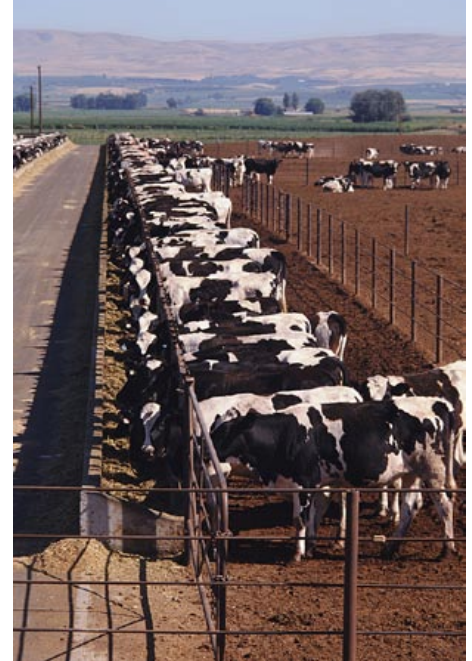
In focus groups, the treatment of food animals elicited the most emotion.

For the topics of working conditions and wages, focus group participants were interested in the treatment of farmworkers, such as backbreaking labor performed for very low pay, and the exploitation of migrant workers. Workers involved in other aspects of the food system, such as processing or retail, were not discussed as frequently. When asked specifically to list criteria they would like to see improved for workers involved in the food system, participants mentioned higher wages, protection from exposure to pesticides, health