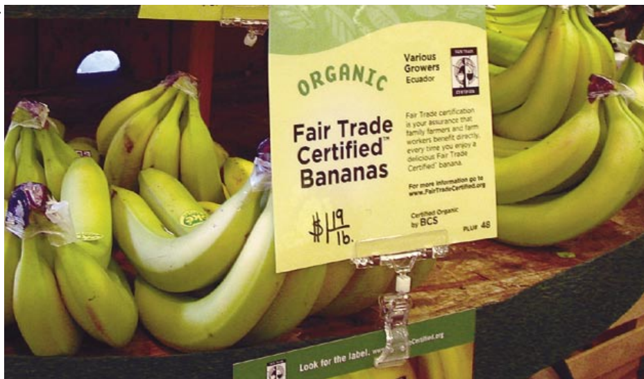
Surveyed consumers wanted information about their food to be available at the point of purchase. Product labels, brochures and retail displays, above, were the most-preferred options.

In April 2004 the survey was sent to 1,000 households in the study area, using randomly sampled names and addresses provided by the marketing firm USADATA. A modified Tailored Design Method was employed, which involved four mailings: (1) a pre-notice letter, (2) the survey with a $1 bill incentive and stamped return envelope, (3) a follow-up postcard and (4) a replacement survey and return envelope (Dillman 2000). While this method typically also employs a second replacement survey mailing, this step was omitted due to budget constraints. The final response rate was 48.3%. The survey instructions indicated that the primary food purchaser for the household was to complete the questionnaire. Respondents' demographic characteristics were generally similar to those identified in the 2000