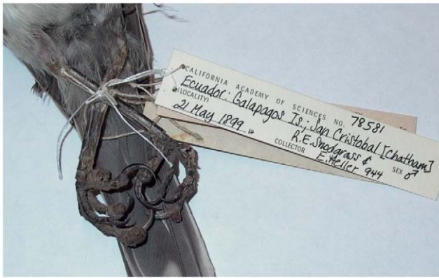
Figure 3. Chatham Mockingbird ( Mimus melanotus ) collected in May 1899 from San Cristobal Island (in CAS collection). The lesion on the center left toe was sampled, and was positive for Avipoxvirus by histopathology and PCR. doi:10.1371/journal.pone.0015989.g003