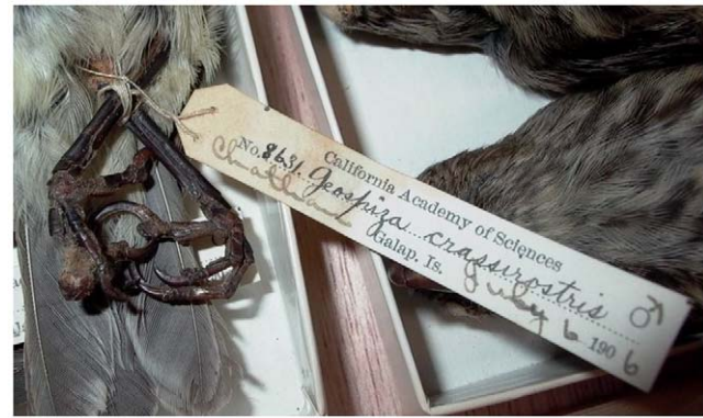
Figure 4. Vegetarian Finch ( Geospiza crassirostris ) collected in July 1906 from San Cristobal Island (in CAS collection). The lesion on the center left toe was sampled, and was negative for Avipoxvirus by histopathology and PCR. doi:10.1371/journal.pone.0015989.g004

common landing sites on both inhabited and uninhabited islands, they have likely contributed to the presence of this virus and other pathogens across the archipelago. Of these groups, only scientists undergo rigorous quarantine procedures to minimize or eliminate transport of organisms between islands. In modern times, pox-like symptoms are reported regularly in birds on Santa Cruz, Isabela, San Cristobal, and Floreana [12,15,17], and in much lower prevalences on uninhabited islands of Santiago and Marchena (Jimenez-Uzategui, pers. comm.) and during extreme weather events such as El Nino on the uninhabited island of Genovesa [14].