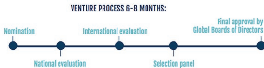
Figure 9.1. Ashoka's process of search and selection