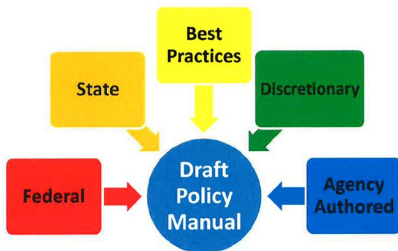
Figure 1: The Components of a Lexipol Policy Manual 72

Jurisdictions can choose whether to adopt, reject, or modify each policy. 73 Lexipol advises its users to “fully understand the ramifications and