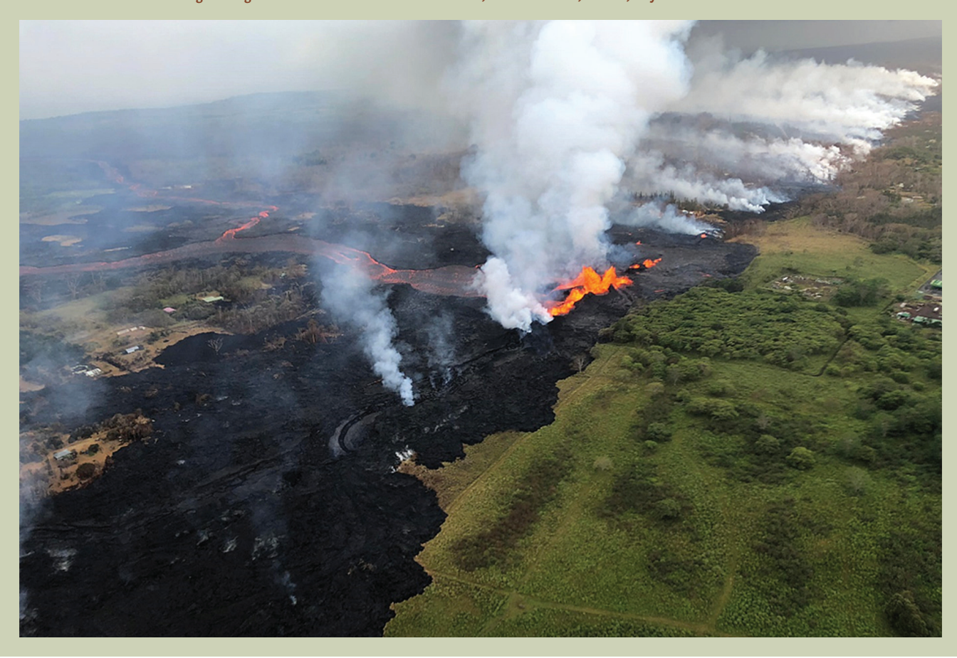
Aerial view of lava flow invading housing subdivisions in the Lower East Rift Zone, Kīlauea volcano, Hawai'i, May 2018.

MANAGEMENT RESPONSE TO KĪLAUEA VOLCANO ERUPTION OF 2018 AND 2020, HAWAI'I VOLCANOES NATIONAL PARK, USA Hawai'i Volcanoes National Park (HAVO) is located on the island of Hawai'i, the largest island of the Hawaiian archipelago. The park comprises more than 21 square miles and includes two historically active volcanoes, Kīlauea and Mauna Loa, within its boundaries. The area was designated a national park in 1916. Owing to its unique geological features and biodiversity, the park was further designated as a UNESCO biosphere reserve in 1980, and was inscribed on the World Heritage List in 1987 under criterion viii for its unique geological features.