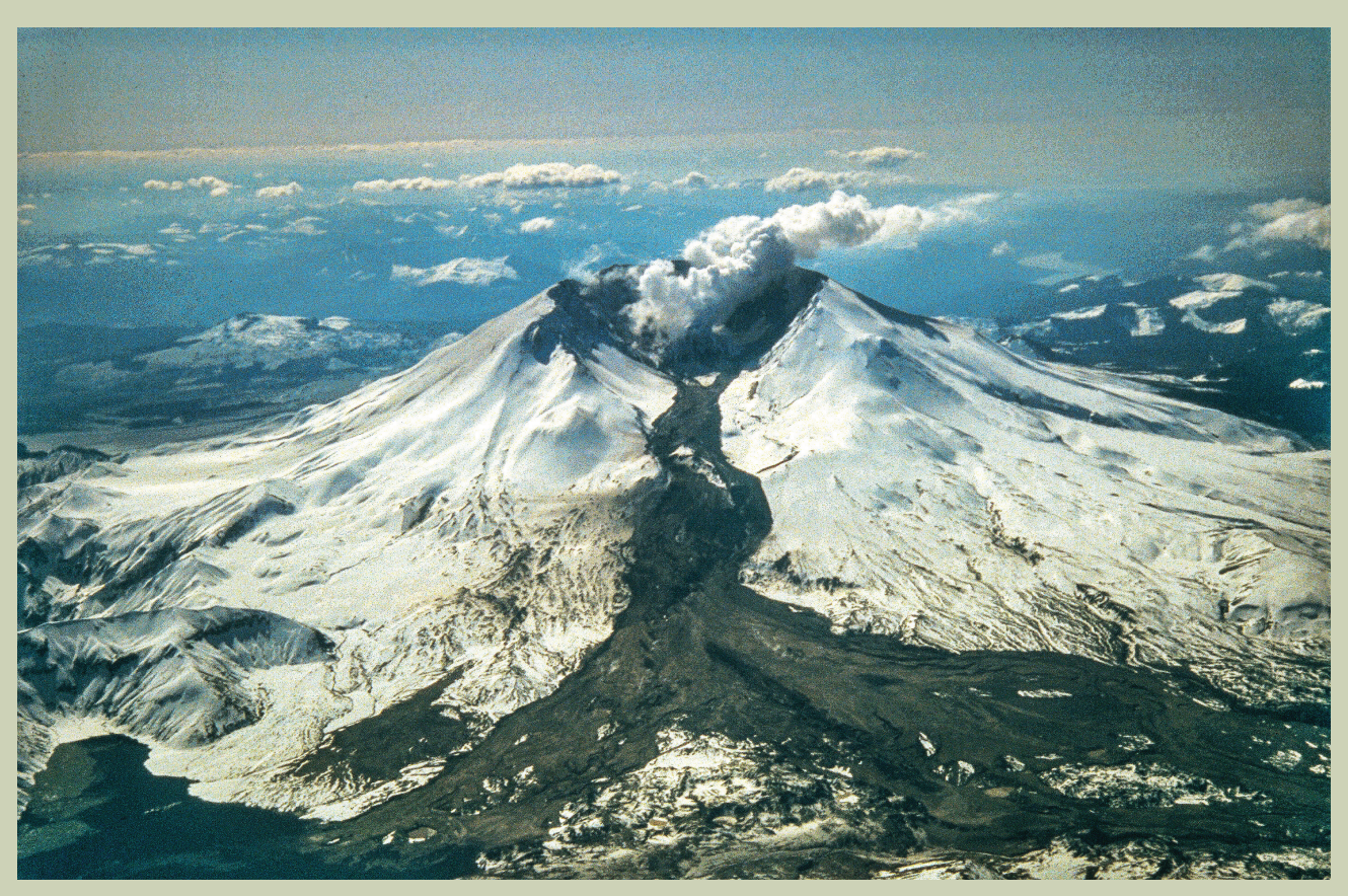
Mount St. Helens in 1982, showing the active volcano, a new lahar, and Spirit Lake (lower left).

multi-criteria decision-making approach was specified (NASEM 2018). In 2019, USFS commissioned the William D. Ruckelshaus Center of the University of Washington and Washington State University to develop a report titled Situation Assessment for the Long-Term Management of the Spirit Lake/Toutle—Cowlitz River System (Ruckelshaus Center 2019). The purpose was to engage a broad spectrum of stakeholders in order to identify and clarify key issues to be considered within a multi-criteria decision-making framework.