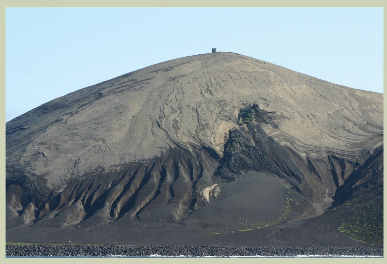
Surtsey World Heritage Site, Iceland: A new island dedicated to long-term research of ecosystem dynamics, and closed to visitation.

The eruption of Mount St. Helens on May 18, 1980, was unusually well monitored and observed and subsequently studied by scientists from around the world. Our current understanding of several important eruptive processes such as volcano sector collapse, the dynamics of pyroclastic surge and flows, the mechanics of debris flows and mudflows, and degassing of continental stratovolcanoes all originated with observation and studies of the 1980 eruption. With 57 fatalities, the 1980 eruption was the deadliest and most economically destructive volcanic event in the history of the United States. In 1982, the landscape around the volcano was protected as Mount St. Helens National Volcanic Monument to preserve the volcano and allow for the eruption's aftermath to be scientifically studied: a new gift to