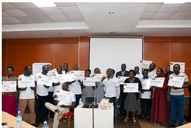
Fig. 2. Site representatives after final ball was selected.

and replaced it after selection. This was done to generate a four-digit randomization code used to determine assignment to Group A or Group B. The number on each football corresponded with one number of the four-digit code and the order in which footballs were picked corresponded with the order of the numbers in the four-digit code. The spreadsheet created by the trial statistician was projected for the audience to see and the group assignment for each health center associated with the selected code was read out loud. To make the process more participatory, a representative from each trial health center was asked to retrieve and display large placards printed with their health center's name and number and congregate on either side of the front of the room, depending on group assignment. An NTLPL representative was seconded by the audience to pick the last football to determine arm assignment for each group. Photos were taken with health center representatives in each group holding their respective placards and a printed sign to indicate arm assignment (Fig. 2).