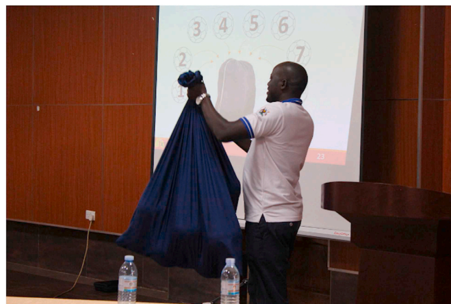
Fig. 1. 10 balls used for randomization were placed in an opaque bag.

The randomization process was facilitated by the local lead investigator. Ten footballs of the same size and color labeled with a number between 0 and 9 were displayed to the audience before they were placed in an opaque bag (Fig. 1). One by one, randomly selected representatives from four trial health centers picked a numbered football from this bag