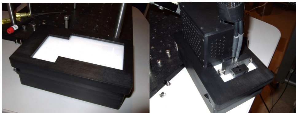
Fig. 1. Setup for calibration measurement. In order to measure the same phantom volume each time, a mask was prepared to fit the phantom (left) and lock the probe in place (right).

Phantoms purchased from INO were specified to have absorption and reduced scattering in the range of 0.01 \text{mm}^{-1} and 1 \text{mm}^{-1} . The phantoms were prepared from a soft polyurethane matrix. Titanium dioxide particles (mean particle size 3 \mu\text{m} ) were added as a scattering agent. A NIR dye was added to obtain an absorption feature at 750 nm. Carbon black was further added to raise the absorption at other wavelengths. INO made the phantom dimensions the same as the “ACRIN” phantoms using a mold supplied by the UC Irvine team (Fig. 1).