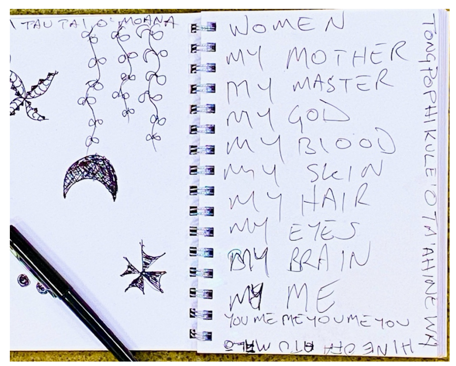
Figure 3. Katharine Losi Atafu-Mayo's notebook included in Feso'ota'i atu (Connection) for audiences to draw and write in as they engaged with the piece, 2020. SALTWATER / Interconnectivity , Tautai Gallery, Auckland, Aotearoa New Zealand.