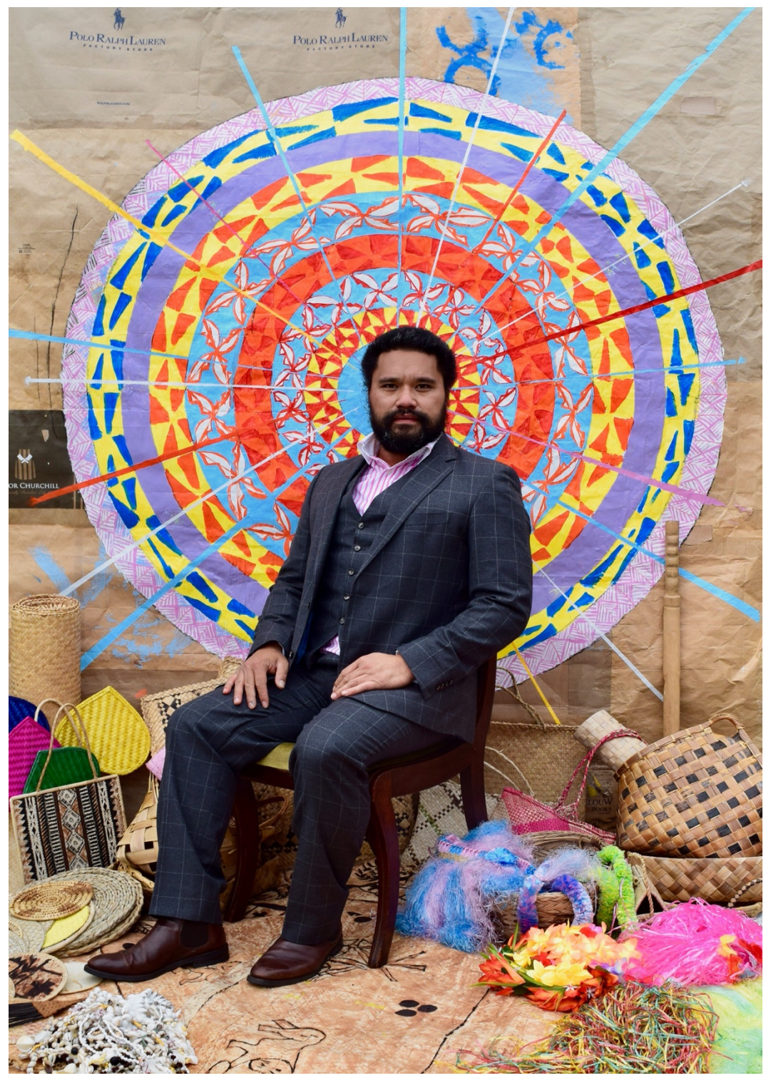
Figure 10. Telly Tuita, A Professional Brown Man, 2018. Digital print installed as part of I Left My Heart in Tongpop, 2020. SALTWATER / Interconnectivity, Tautai Gallery, Auckland, Aotearoa New Zealand.