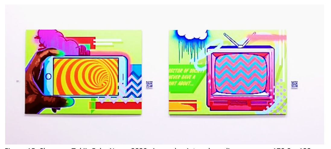
Figure 15. Shawnee Tekii, Fake News , 2020. Aerosol paint and acrylic on canvas. 170.8 x 122 cm each. SALTWATER / Interconnectivity , Tautai Gallery, Auckland, Aotearoa New Zealand.