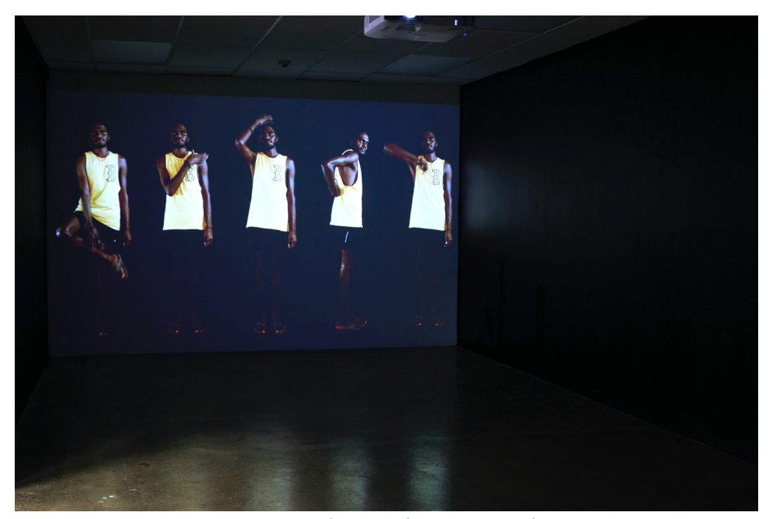
Figure 11. Gutinjarra Yunupinu, Gurrutu'mi Mala (My Connections ), 2019. Film installation. HD two-channel digital video, 4K. SALTWATER / Interconnectivity , Tautai Gallery, Auckland, Aotearoa New Zealand.

Here, I demonstrate my position in the world of gurrutu through my first language barrkunu wana (language from a distance [Yolnu sign language]). I am signing Yolnu gurrutu names to you, revealing how they connect and relate to me. 16