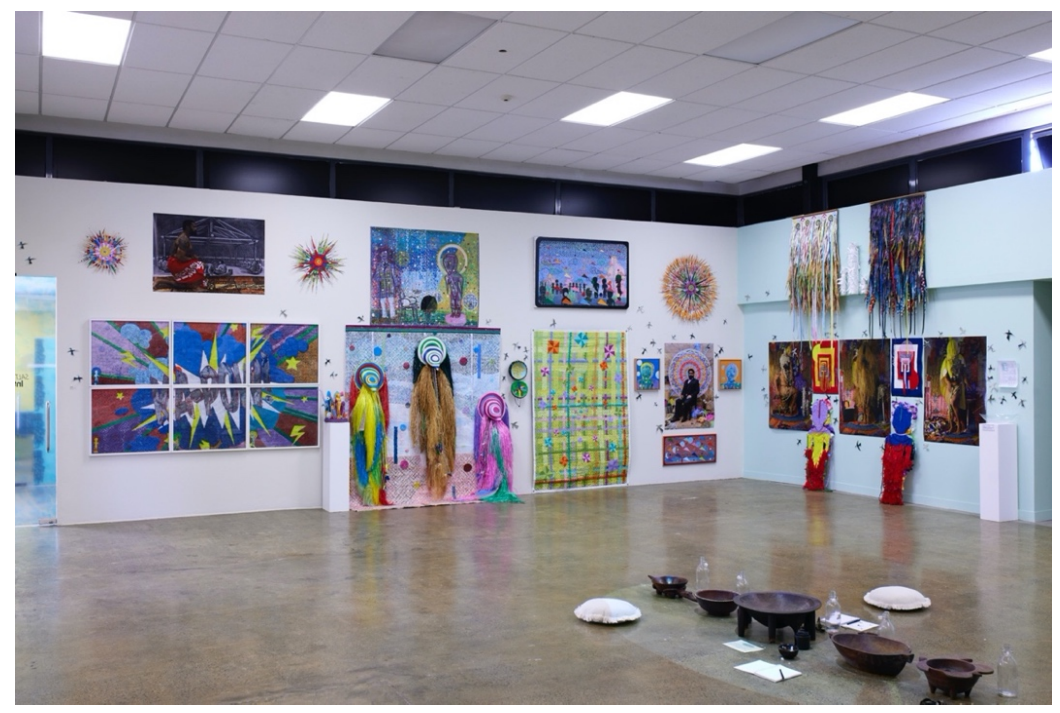
Figure 8. Telly Tuita, I Left My Heart in Tongpop , 2020. Multimedia installation. SALTWATER / Interconnectivity , Tautai Gallery, Auckland, Aotearoa New Zealand.