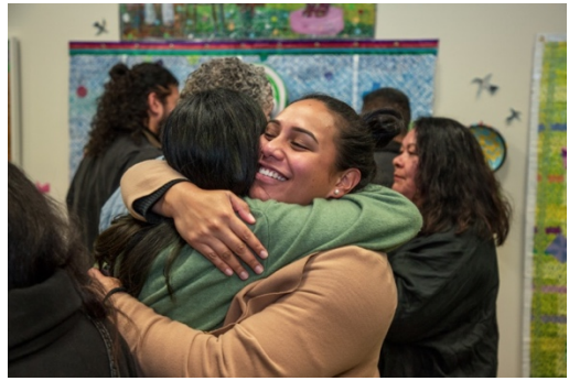
Figure 1. Community engagement at the opening of SALTWATER / Interconnectivity , October 15, 2020.

"Interconnectivity" in the exhibition's title refers to the connections that unite and connect Tangata o le Moana (Pacific Island peoples). Tautua is the Sāmoan word for service to community. Tautai is the Sāmoan word for navigator, one who leads and shows the way. We centred the exhibition on Indigenous ways of being, knowing, and wayfinding, as well as the navigation of ancestral,