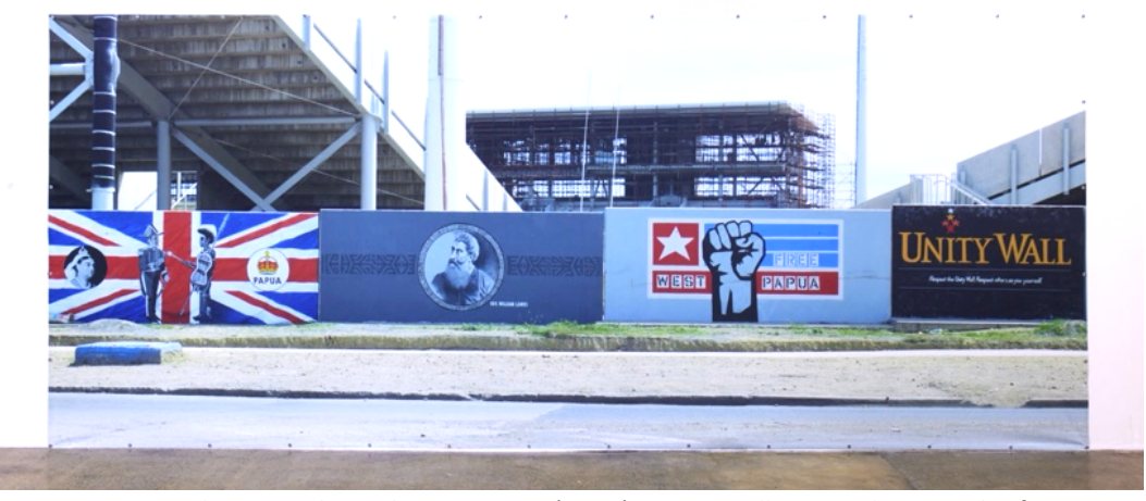
Figure 14. Peter Elavera and Kamilion Art Krew (KAKS), Unity Wall , 2019. Photograph of a portion of the painted mural, each section 6 x 2.5 m, 2020. SALTWATER / Interconnectivity , Tautai Gallery, Auckland, Aotearoa New Zealand.

In the photograph of the mural displayed in the gallery, Elevara also included more recent images of colonial occupation and the enduring Indigenous cultures of PNG. The third billboard (from the left in Fig. 14) depicts the Morning Star Flag of the Free West Papua movement. Elavera superimposed a raised fist, evoking the Polynesian Panthers and the legacy of the Pasifika freedom fighters, over the flag. He asserts that Unity Wall "calls for a united voice against tyranny and for political independence to the West Papuan determination for freedom. Free West Papua." In an interview, Elavera connects anticolonial and decolonising movements with Moana-Solwara art and unity: