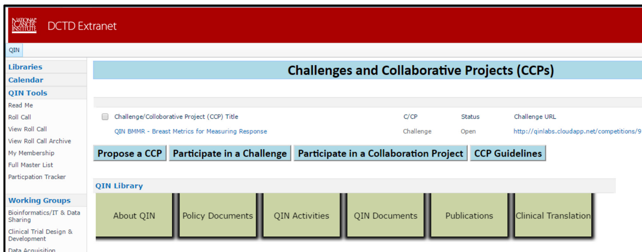
Figure 2. The CCP panel on the QIN SharePoint site serves as a bulletin board for information about current QIN CCPs.

federally funded national or international researchers with project aims relevant to the QIN mission, and approved by the QIN Executive Committee.