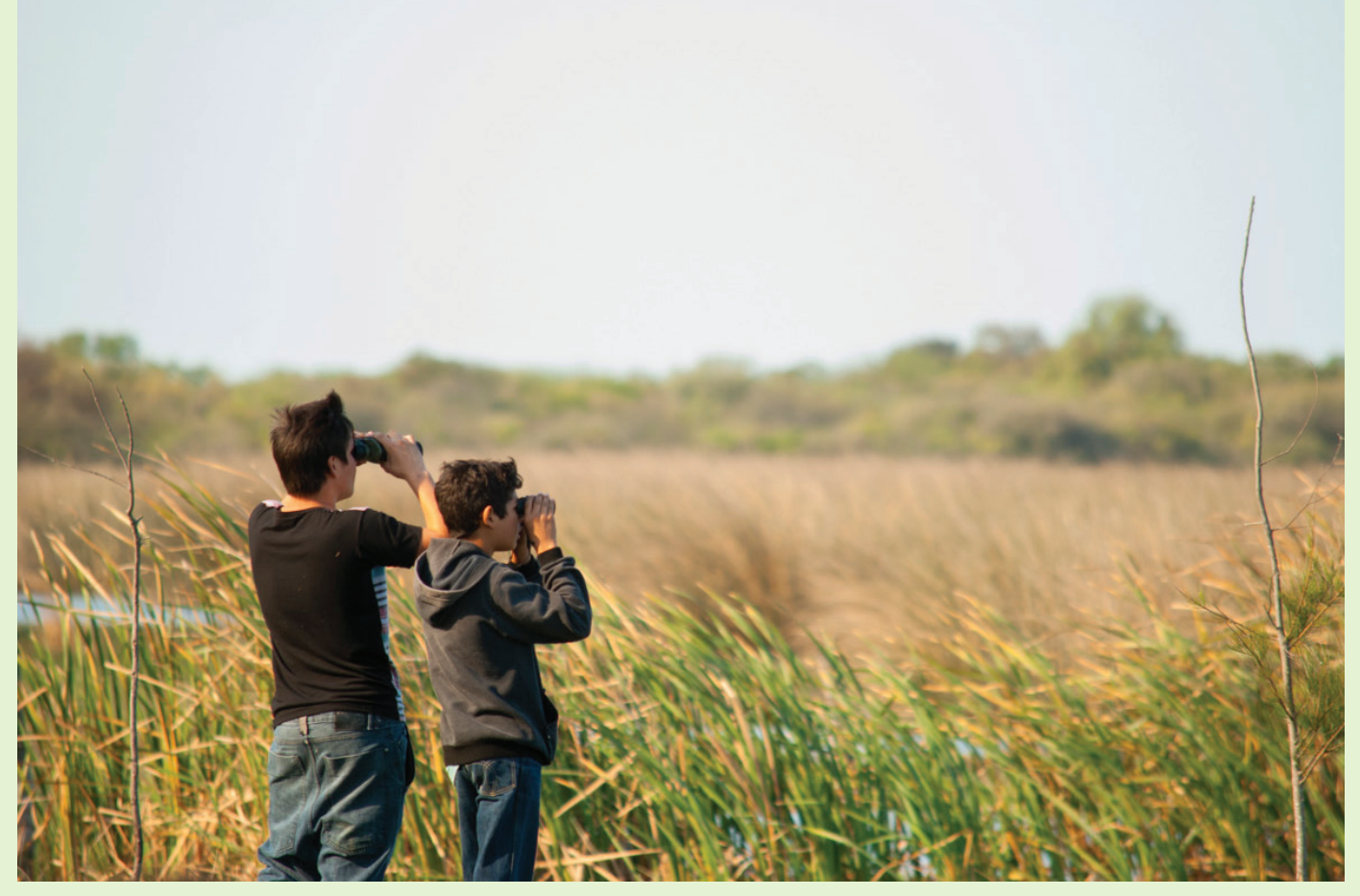
Figure 2. Children from an Earth Guardian school count waterfowl at a wetland in Argentina.

with and utilize wildlife resources—putting the decisions in the hands of the community members.