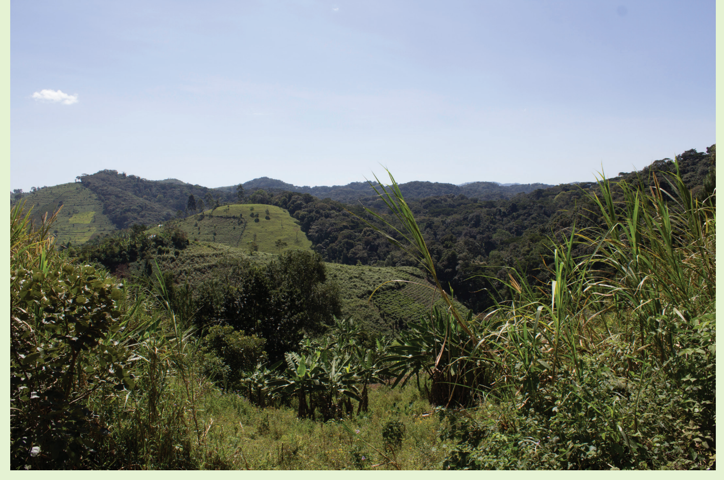
Figure 4. Bwindi Impenetrable Forest edge and surrounding Batwa settlements, southwestern Uganda. | TIERRA SMILEY EVANS

provide. Programs such as REDD+ and UN-REDD (the United Nations' efforts to reduce carbon emissions through deforestation and forest degradation), the Forest Carbon Partnership Facility, and the Forest Investment Program of the World Bank support reimbursements to lowand middle-income countries for effective carbon sequestration. While understood by governing bodies, these programs are rarely tangible at the local level and become a lower priority during times of immediate economic hardship and public health emergencies, such as the COVID-19 pandemic. Integrating public health concepts into conservation policy is a tool that could be especially helpful during these times. The connection between healthy forests and wildlife and human disease is already a concept that is part of numerous Indigenous cultures. In many societies dependent on forests, folklore exists that describes disease emerging from the forest when trees or wildlife populations are harmed. Incorporating these local beliefs into conservation messaging would go a long way toward engaging