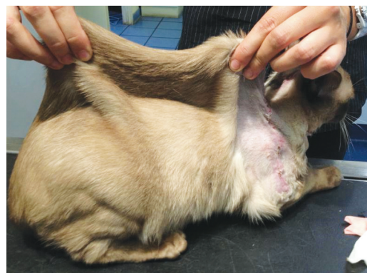
Figure 1 Cats with cutaneous asthenia can display with skin extensibility, as shown in this cat.

A few of the recessive traits are recognized later in a cat's life, such as the cutaneous asthenia variants (also known as Ehlers-Danlos syndrome; see Figure 1) in COL5A1 5 and cystinuria in SLC7A9 . 6 Although rare, these variants may need to be monitored in a breed as they might be detected after a mating has already occurred, when the cat was not yet affected, and also because the resulting conditions are less well known by cat breeders. Hypokalemia, which is caused by a variant in the gene WNK4 , can be identified when a cat is older and undergoes a stressful situation. 7 This disease can be treated with potassium supplementation; however, eradication of the variant is important to prevent the spread of the disease in the breed population. 8 Burmese breeders have actively attempted to eliminate this variant from the population and the current disease and variant frequencies are suspected to be very low.