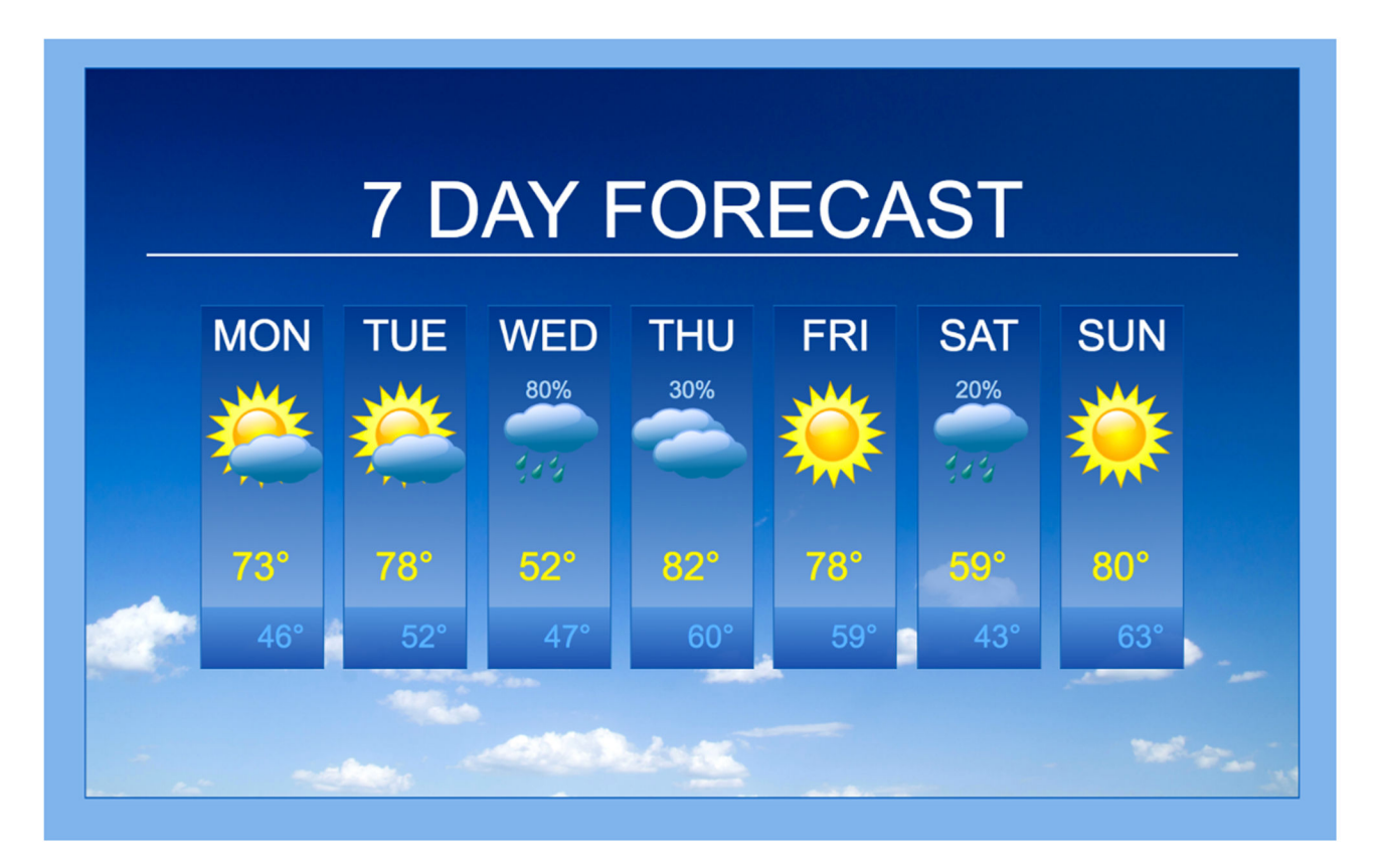
Figure 1. An example of the weather forecast stimuli. Participants studied a forecast such as this for 120 seconds before they were asked to recall as many details as they could (verbatim information), as well as which days would be best to have a picnic and bring an umbrella (gist-based information).