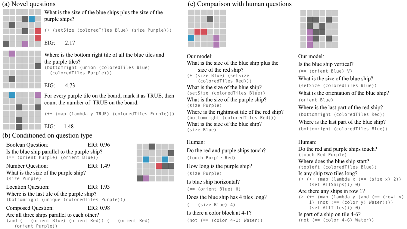
Figure 3: Examples of model-generated questions. The natural language translations of the question programs are provided for interpretation. (a) shows three novel questions generated by the RL model, (b) shows an example of the model generating different type of questions by conditioning on the decoder, (c) shows questions generated by our model as well as humans.

In Figure 3c, we compare arbitrary samples from the model and people in the question-asking task. These examples again suggest that our model is able to generate clever and human-like questions. There are also meaningful differences; people often ask true/false questions as mentioned before, and people sometimes ask questions with quantifiers such as “any” and “all”, which are operationalized in program form with lambda functions. These questions are complicated in representation and not favored by our model.