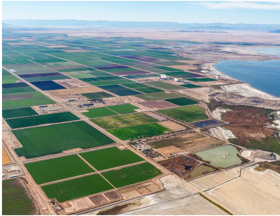
Agricultural fields near the Salton Sea. Nearly 90% of the Sea's water comes from irrigation runoff from the agricultural lands in the Imperial Valley.

In response to these possibilities, along with prior commitments to mitigate expected environmental problems arising from the QSA, local, state and federal governments are investing significant