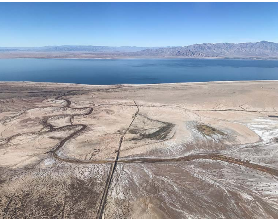
Previous riverine inputs into the Salton Sea that have since dried out. Without informed and timely strategies to address the decline in the Salton Sea, environmental and human health-related catastrophes will grow.

environmental health — and how a significant amount of money has been appropriated for investing in developing plans to address the environmental and human health concerns surrounding the Salton Sea. Because of the delayed response in developing and implementing actual mitigation plans to counter the expected environmental and health-related consequences associated with the QSA until more recently, there has been a common refrain to cease with the studies and move forward with shovel-ready mitigation projects (Byrant 2021).