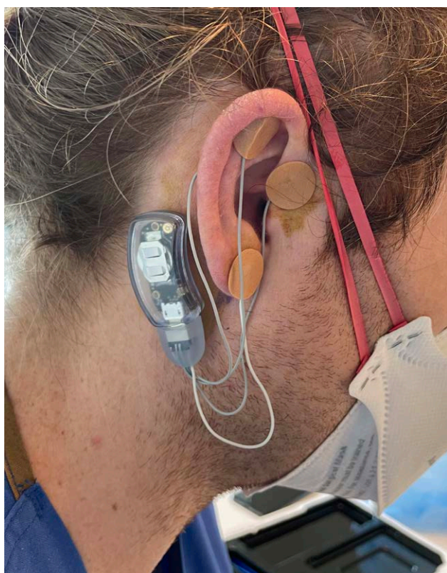
Figure 2. A percutaneous auricular nerve stimulation system (NSS-2 Bridge, Masimo). The pulse generator is adhered directly to the patient behind the ear over the mastoid process. Leads are placed: (1) at the most cephalad portion of the antihelix, (2) immediately cephaloanterior to the incisura and posterior to the superficial temporal arterial pulse, and (3) on the posterior ear opposite the antihelix at the level of the incisura. The ground electrode is inserted on the anterior side of the lobule (ear lobe).

information and in situ device imaging in the form of a case series were obtained from all patients.