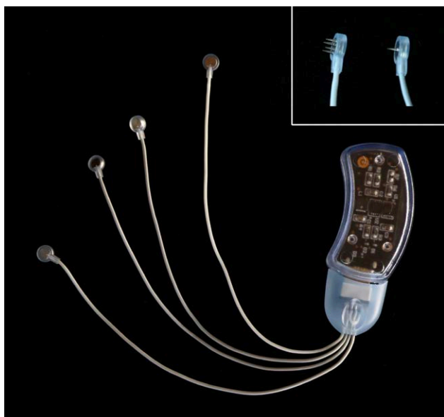
Figure 1. A percutaneous auricular nerve stimulation system (NSS-2 Bridge, Masimo). Each of the 3 electrodes has a 2-millimeter-long integrated needle/lead (inset), and the ground electrode has four 2-millimeter-long integrated needles—also termed “leads” (inset).