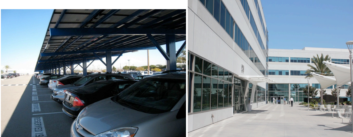
Figure 2. L.A. AFB PV canopy left and base central plaza right

While climate is only marginally important to the project, the temperate California location offers some benefits and some potential negatives, e.g. good battery performance but coupled with frequent air conditioning use. An aspect of location of great importance, however, is the institutional context it implies, notably the local electricity utility service territory. Were the base in LADWP territory, which is a municipal utility not within the CAISO footprint and not regulated by the CPUC, the project could be quite different. This aspect is noteworthy because regulatory barriers to the project have been one of the major problems experienced to date; however, it should be noted that absent open CAISO AS markets to provide revenues, the economics of the project would be dependent on less transparent bi-lateral contracts.