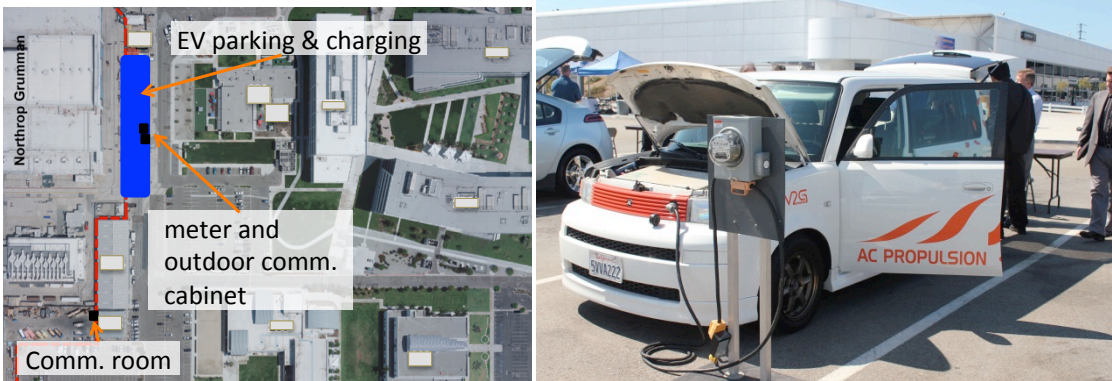
Figure 1. Aerial view of L.A. AFB left and a V2G capable sedan right

create the PEV parking area. This picture does not show some of the important more recent features, notably a large (300 kW) canopy PV array in the parking lot still further east, shown in Figure 2 below. Also shown is a picnic area seen in the aerial view along the right (south) edge. A parking structure with planned ground mount PV nearby has also been constructed west of the dispatchers' building, and various other rooftop arrays have also been recently installed.