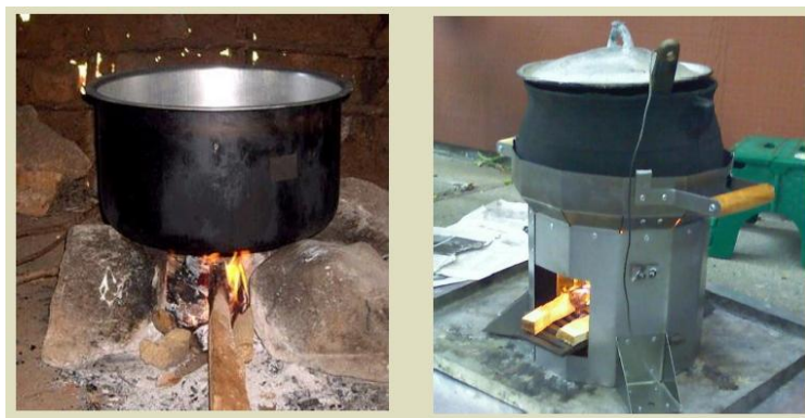
Figure 1. Pictures of the three stone fire (left) and the Berkeley-Darfur Stove (right).

The BDS and TSF are compared in this study using the same cooking test, which featured the boiling of water. The pictures of BDS and TSF are shown in Figure 1. Like other water boiling tests intended to mimic cooking food, this test is intended to simulate the cooking of Assida, a common food in Darfur. In this test, a wood fire was ignited by burning one sheet of crumpled newspaper, and 2.5 L of water in a 2.3 kg metal Darfur pot was heated from an average temperature of 21 \pm 4 °C to 100°C. The temperature of the water was recorded using a digital thermometer equipped with a type K thermocouple. After the water began to boil, a flaming fire was maintained and the water temperature was not permitted to drop below 94 °C for 15 minutes. After this 15 minute period, the fire was extinguished so that the remaining mass of wood could be measured. This test, therefore, does not capture pollutant emissions under exclusively smoldering conditions that occur when flames extinguish.