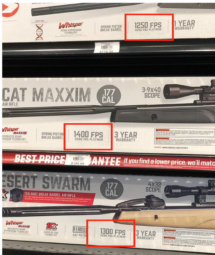
Image 3. Example of maximum velocity.

The pellet typically entered transnasally, transocularly or transtemporally, where the bone is the thinnest. 11,30,31 Several authors warn that children with these penetrating head injuries appear fine and maintain consciousness but may rapidly deteriorate. 25,32 However, injuries to the abdomen and thorax may result in fatality as well.