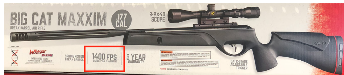
Image 1. Example of an air rifle.

Emergency medical technicians arrived to find a man lying on the sidewalk for an unknown period of time. They provided Advanced Cardiac Life Support care, intubated the man, and placed him on a cardiac monitor. The reading