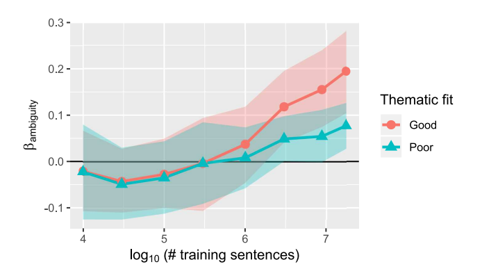
Figure 2: Estimated coefficient of Ambiguity at the critical verb in the surprisal analysis, as a function of number of training sentences and thematic fit. Shaded areas represent 95% Credible Intervals.

LSTM surprisal (Futrell et al., 2018; Van Schijndel & Linzen, 2018).