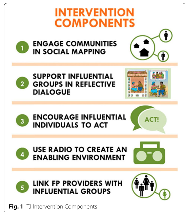
Fig. 1 TJ Intervention Components

opinion leaders of both sexes are invited to become TJ network actors and oriented to Components 2 and 3.