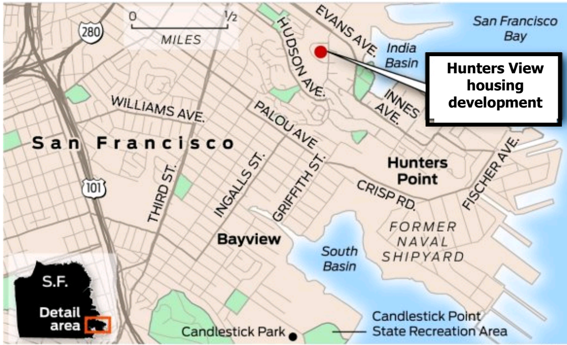
Figure 2. Map Showing the Location of Hunters View Development within the Bayview Hunters Point Neighborhood

Advocates for the neighborhood point out that Bayview Hunters Point has a rich cultural history and has long been the center of what residents describe as a close knit residential community. This is a place where families live, where they help each other out, where roots run deep. What Bayview Hunters Point has never been is a thriving commercial center or a transportation hub with strong links to the downtown business district. Residents living in Hunters Point often came to this neighborhood because of its proximity to industrial jobs and the absence of racially restricted covenants in the neighborhood. When those jobs left, the neighborhood that was once an industrial center of national import was forgotten. It became a leftover artifact hampered by environmental degradation, racial segregation, and poverty. It remained a community apart from the city and never a part of the city.