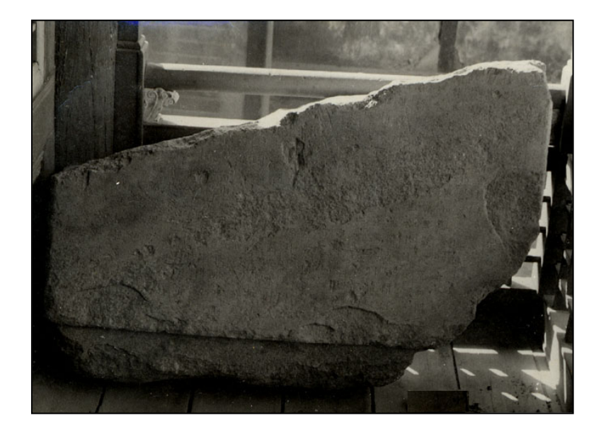
Figure 7: The King Munmu Stele, currently found in the Gyeongju National Museum.

Silla did not abandon this program, even though King Munmu's original claim was simply ignored by the Tang. Notably, by justifying its military activity based on Tang Taizong's original promise, Silla made clear that it had no designs north of Pyeongyang and the Daedong River. Silla was stating that, if Tang accepted Silla's territorial claim, Silla would otherwise respect the "Tang world order," but if Tang refused Silla's demands, Silla would be forced to pursue a war with consequences uncertain to all, including the Tang.