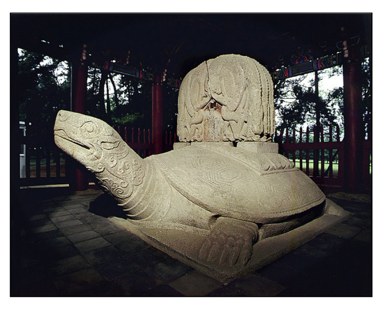
Figure 6: The decorative capstone and tortoise base of the King Muyeol Stele. Image used with permission from South Korea's National Research Institute of Cultural Heritage (http://www.nrich.go.kr/eng/).

The title of the inscription, the "Stele of the Tomb of King Munmu" (Munmu wangneung ji bi 文武王陵之碑), is also highly significant. It contrasts notably with the title of the King Muyeol stele, which is recorded in the decorative head of the stele preserved in the National Museum in Gyeongju as the "Stele of Great King Muyeol, the Great Ancestor"