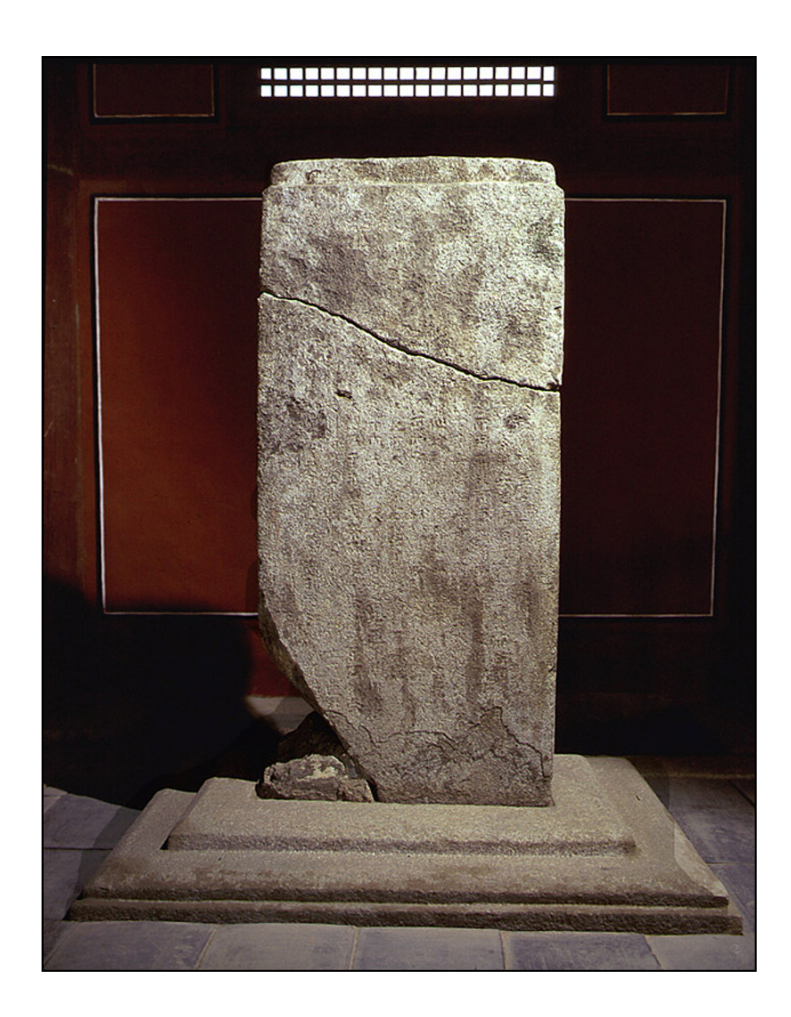
Figure 5: The Bukhan Mountain Memorial Stone, currently found in the National Museum of Korea. Use of this image is by the kind permission of South Korea's National Research Institute of Cultural Heritage (http://www.nrich.go.kr/eng/).

Nevertheless, King Jinheung does not assert in these monument stones that he is himself the supreme manifestation of morality, or that he has a monopoly on all virtue. Indeed, he frequently downplays his own role. For instance, in the Changnyeong monument stone, he describes how he came to the throne at a young age and passed all government responsibilities to his ministers, while in the Bukhan Mountain monument stone he describes