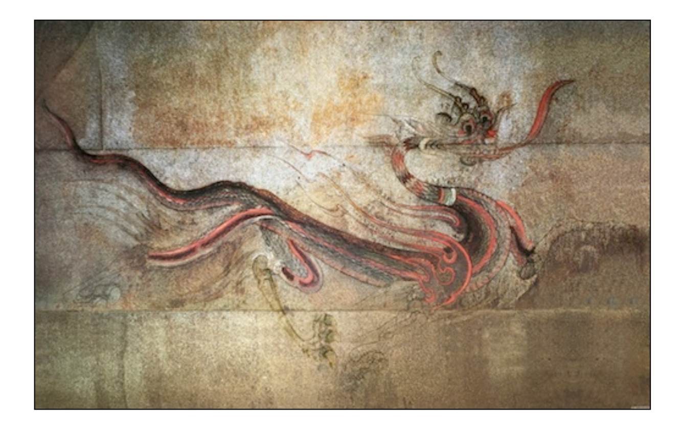
Figure 3: Picture of the Blue Dragon, one of the Four Directional Animals, from the Gangseo Great Tomb, a seventh-century Goguryeo tomb in North Korea.

The reason that the inscription does not include the perfectly respectable immediate ancestors of King Gwanggaeto—both king of warriors and warrior king—was that the sacred origins of the Goguryeo monarchy were far more important. Especially important was the myth of King Chumo, whose story made up more than half of the preface. This myth established that the Goguryeo kings had celestial origins, and that the power of the monarchy derived from their descent from both Heaven and the Water God. The war of conquest unleashed by King Gwanggaeto, and the ruling order established by these wars, were both justified by Heaven's will.