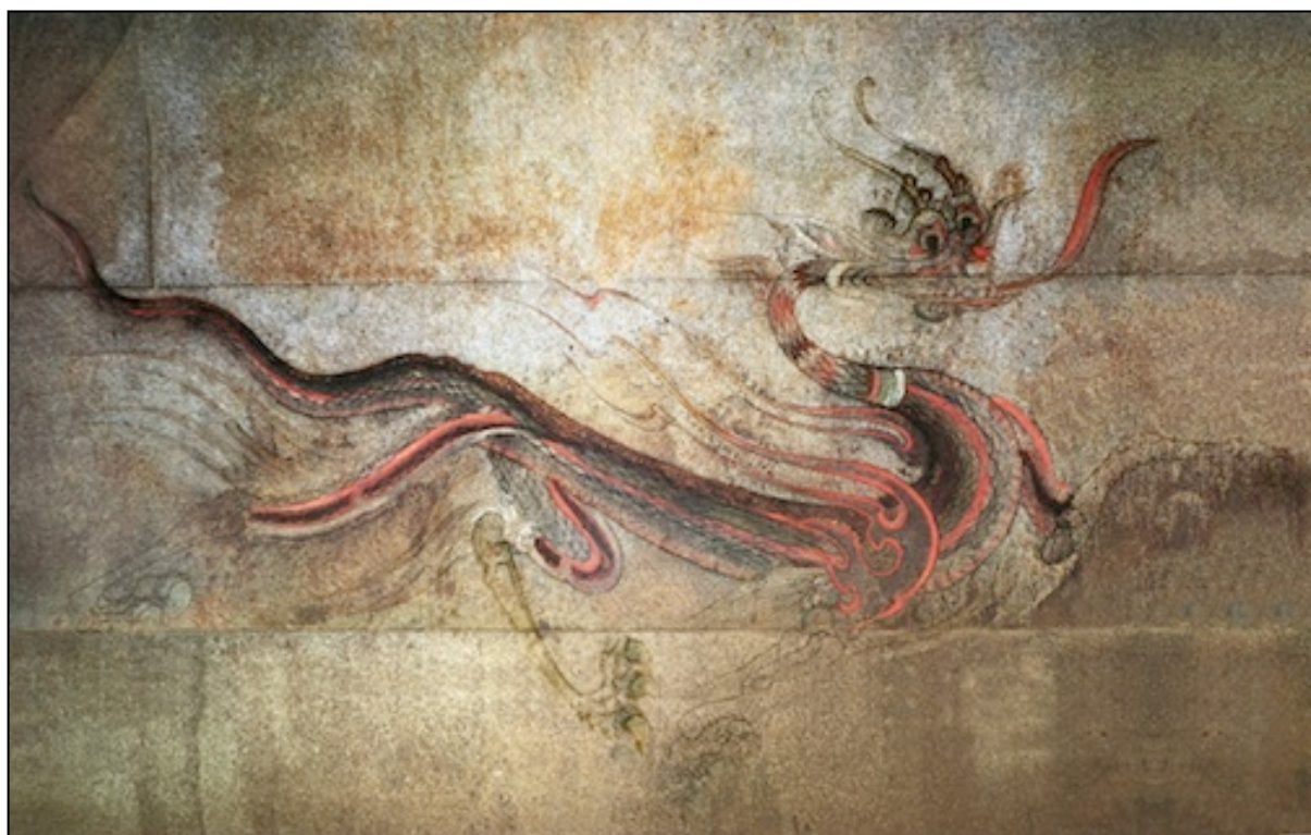
Figure 3: Picture of the Blue Dragon, one of the Four Directional Animals, from the Gangseo Great Tomb, a seventh-century Goguryeo tomb in North Korea.

The reason that the inscription does not include the perfectly respectable immediate ancestors of King Gwanggaeto—both king of warriors and warrior king—was that the sacred origins of the Goguryeo monarchy were far more important. Especially important was the myth of King Chumo, whose story made up more than half of the preface. This myth established that the Goguryeo kings had celestial origins, and that the power of the monarchy derived from their descent from both Heaven and the Water God. The war of conquest unleashed by King Gwanggaeto, and the ruling order established by these wars, were both justified by Heaven's will.