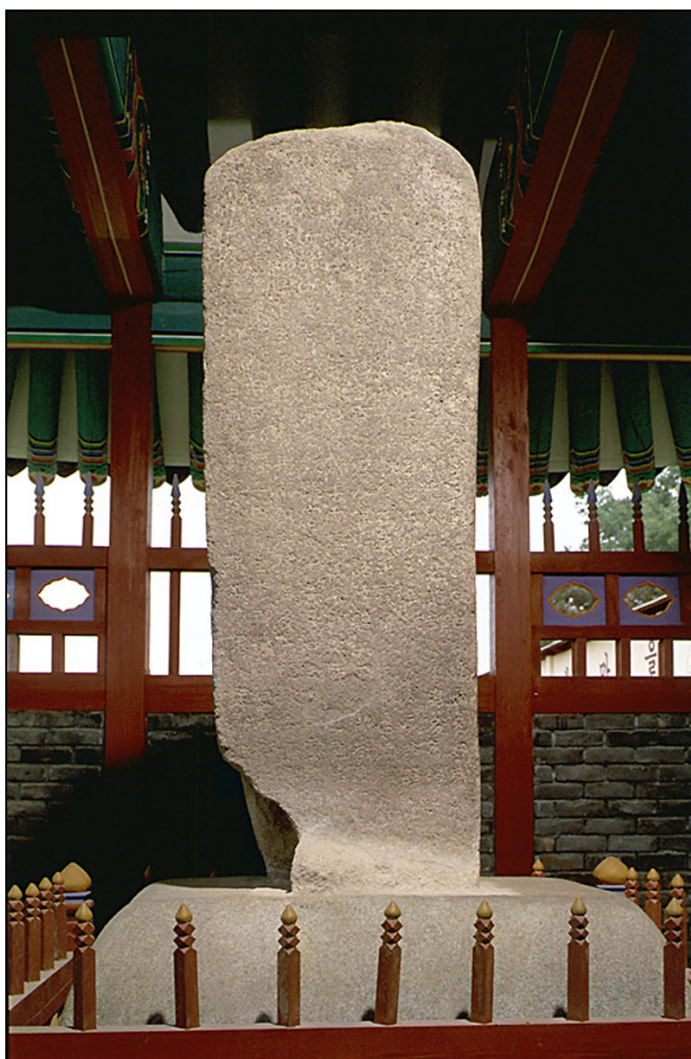
Figure 4: The Jungwon Goguryeo Stele, in Chungju, Chungcheong Province, South Korea, view from the front. Use of this image is by the kind permission of South Korea’s National Research Institute of Cultural Heritage ( http://www.nrich.go.kr/eng/ ).

Soon an alliance between Baekje and Silla against Goguryeo was pursued with a vigor that rendered such minor rhetorical manipulation insufficient. The beginning of this alliance was heralded when Silla’s King Nulji (r. 417–458) decided in 455 to send troops to assist Baekje in an attack on Goguryeo. In 475 Silla responded positively to Baekje’s request for troops during a Goguryeo assault on Baekje’s capital, but the Silla army arrived too late to prevent either the fall of Baekje’s capital, Hanseong, or the capture and execution of Baekje’s