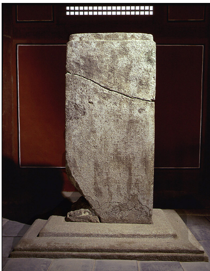
Figure 5: The Bukhan Mountain Memorial Stone, currently found in the National Museum of Korea.

Nevertheless, King Jinheung does not assert in these monument stones that he is himself the supreme manifestation of morality, or that he has a monopoly on all virtue. Indeed, he frequently downplays his own role. For instance, in the Changnyeong monument stone, he describes how he came to the throne at a young age and passed all government responsibilities to his ministers, while in the Bukhan Mountain monument stone he describes