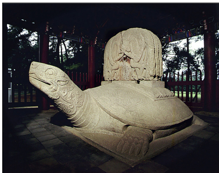
Figure 6: The decorative capstone and tortoise base of the King Muyeol Stele.

The title of the inscription, the “Stele of the Tomb of King Munmu” (Munmu wangneung ji bi 文武王陵之碑), is also highly significant. It contrasts notably with the title of the King Muyeol stele, which is recorded in the decorative head of the stele preserved in the National Museum in Gyeongju as the “Stele of Great King Muyeol, the Great Ancestor”