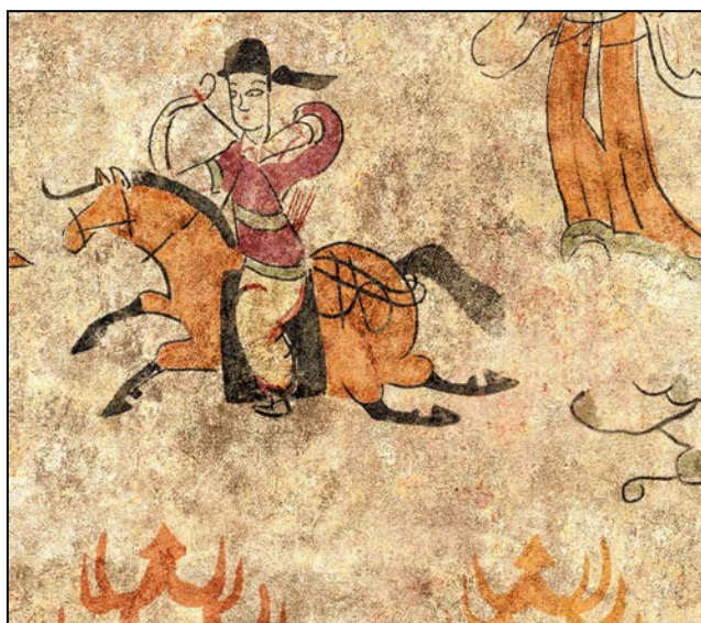
Figure 2: Picture of a huntsman, from the south-wall of the tomb of a Goguryeo official. The tomb is found in present-day Deokheung-ri in North Korea and includes an inscription dated to 408 CE.

King Gwanggaeto’s father and grandfather are not mentioned; rather, the first three Goguryeo kings are mentioned, and then the narrative moves directly to Gwanggaeto’s era. This is not because his immediate ancestors were of dubious legitimacy or associated with insalubrious activities. His grandfather, King Gogugwon (r. 331–371), fought long and hard against the Former Yan dynasty (337–370) and various steppe powers for control of Liaodong; later, when he turned his attention to Baekje, he fell in battle. King Gogugwon’s son, King Sosurim (r. 371–384), encouraged Buddhism, established the first Confucian