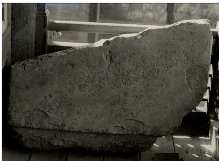
Figure 7: The King Munmu Stele, currently found in the Gyeongju National Museum.

Silla did not abandon this program, even though King Munmu's original claim was simply ignored by the Tang. Notably, by justifying its military activity based on Tang Taizong's original promise, Silla made clear that it had no designs north of Pyeongyang and the Daedong River. Silla was stating that, if Tang accepted Silla's territorial claim, Silla would otherwise respect the "Tang world order," but if Tang refused Silla's demands, Silla would be forced to pursue a war with consequences uncertain to all, including the Tang.