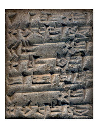
Figure 1: A sample text in Sumerian cuneiform. Since the text is small, it only has one column, which is divided into seven lines. Image from the Cuneiform Digital Library Initiative (2016), CDLI #102525. Image reprinted with permission of Robert K. Englund.

Written Sumerian was primarily logographic: the level of linguistic representation for a given graphical unit would usually be the morpheme (or some sub-morphemic, nonphonemic unit of information), although it also made use of phonography to some degree, with characters sometimes mapping more directly to (strings of) sounds, usually at the level of the syllable (Civil, 1973). A major feature of the system was its extensive use of ambiguity: any given character could have numerous distinct semantic and/or phonological values (Cooper, 1996). A non-exhaustive list of words containing the character \ arrangle can be found in Table 1; this list serves as an example of how a single character may occur in the spellings of words which do not all share semantic or phonological information. The table also demonstrates the lack of strict isomorphism between written form and corresponding spoken form, either in terms of phonemes, syllables, or morphemes. This point is important for our purposes because it means that if written Sumerian bears signs of efficiency, that efficiency cannot have been entirely inherited from spoken Sumerian.