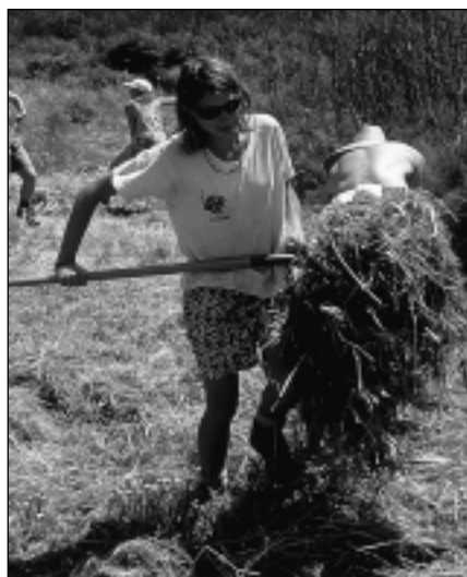
UCSC field quarter students clear mowed fennel from the "mow and remove" treatment plots (May 1993).

Cruz in the last century. Two winters ago, former field quarter students Laura Ruiz and Wes Colvin installed a pig exclusion fence around the study plots to see whether keeping pigs out would increase native-plant recruitment. When surveys conducted a year later turned up oak seedlings and other native species growing in the protected sites, these results confirmed what Gliessman had long suspected: removing pigs from the island will be critical to any restoration effort.