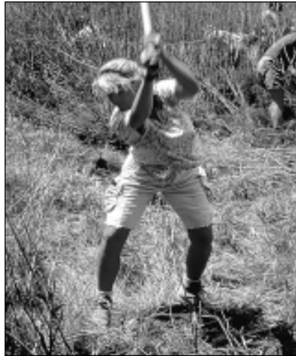
UCSC field quarter student digs up fennel roots in a "dig and remove" treatment plot (May 1990).

Complicating the picture of native plant recovery is the island's burgeoning population of feral pigs, the descendants of farm animals brought to Santa