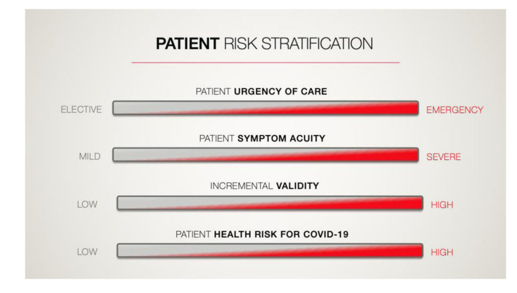
Figure 1. Patient risk stratification.