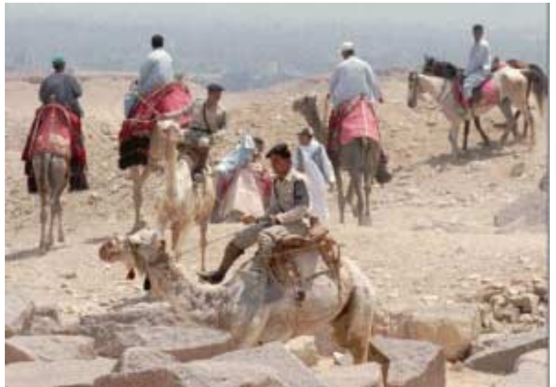
Egyptian policemen patrol on camels beside the Chephren pyramid in Giza in the outskirts of Cairo Friday, April 19, 1996. Security around tourist sites has increased discretely after a suspected Islamic radical group killed 18 Greek tourists in an hotel nearby Thursday.

After the attacks of September 11th, attempts at analysis of any kind were often denigrated as symptoms of cowardice or treason. Pundits and policy makers suggested that to argue that phenomena such as al-Qaeda had social roots was to excuse, or even condone, their apocalyptic actions. As the political scientist Thomas Homer-Dixon pointed out, such arguments are “grade-school non sequiturs” 2 . After all, historians who study Nazism do not justify Auschwitz, and students of Stalinism do not exonerate the perpetrators of the Gulag. Understanding is simply better than the alternative, which is incomprehension. If we fail to grasp the forces behind the attacks of September 11, we will fail to respond wisely.