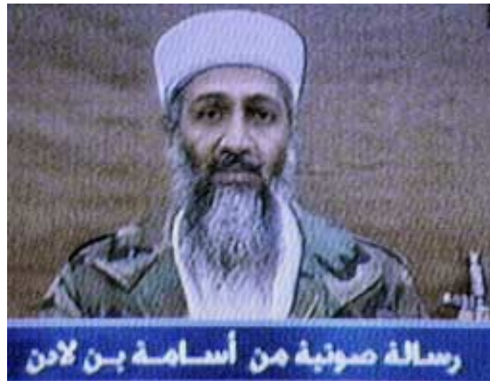
Text at bottom reads "Voice message from Osama bin Laden." Al Jazeera satellite channel broadcast 10/6/02.

Over the longer haul, the needed changes are also likely to be destabilizing in another way: attracting the necessary volume of investment in the region will almost certainly require greater governmental accountability and more transparent rules of the economic game. This is not to say that democracy is needed for growth; it is merely to suggest that it is very unlikely that regimes will attract the necessary private capital from their own citizens or from foreigners if regimes persist in their arbitrary, authoritarian practices. Since there are good reasons to suppose that continued authoritarianism is, in itself, one of the roots of Islamic radicalism, 21 and since con-