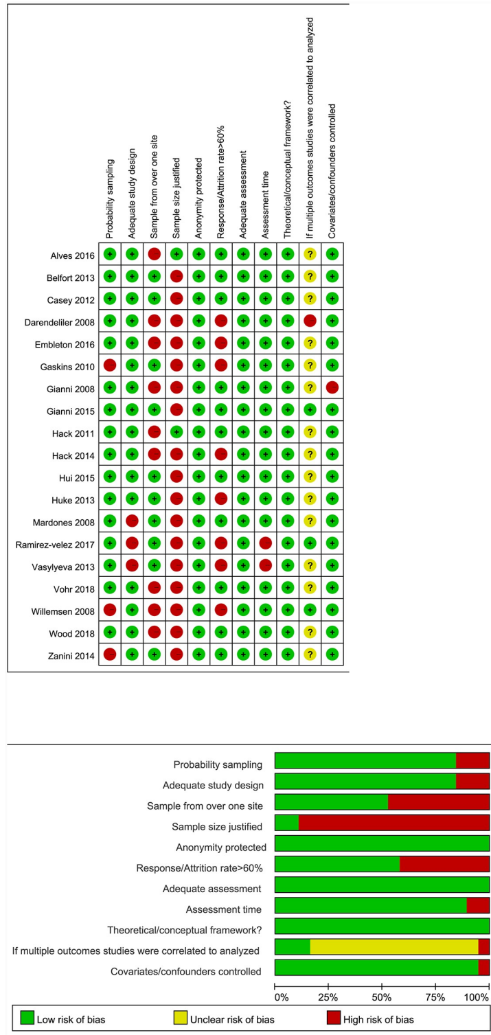
Fig 2. Quality assessment of studies included.

https://doi.org/10.1371/journal.pone.0232238.g002