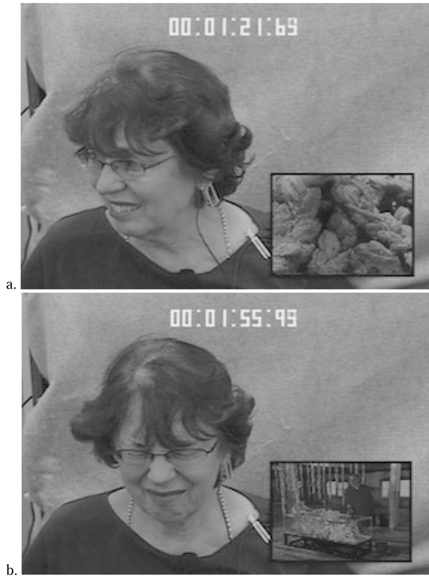
Figure 2. Images of a participant depicting visual avoidance behaviors (a) head turn and gaze aversion (b) head down and eyes closed. (Participant provided informed consent for publishing these images.)