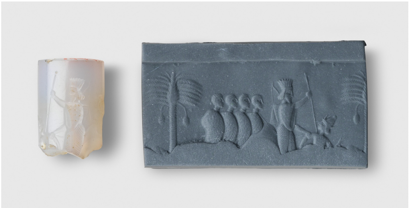
Figure 4. Cylinder seal and modern impression: battle scene with king, soldiers, enemy; Achaemenid ca. 6th–5th century BCE.