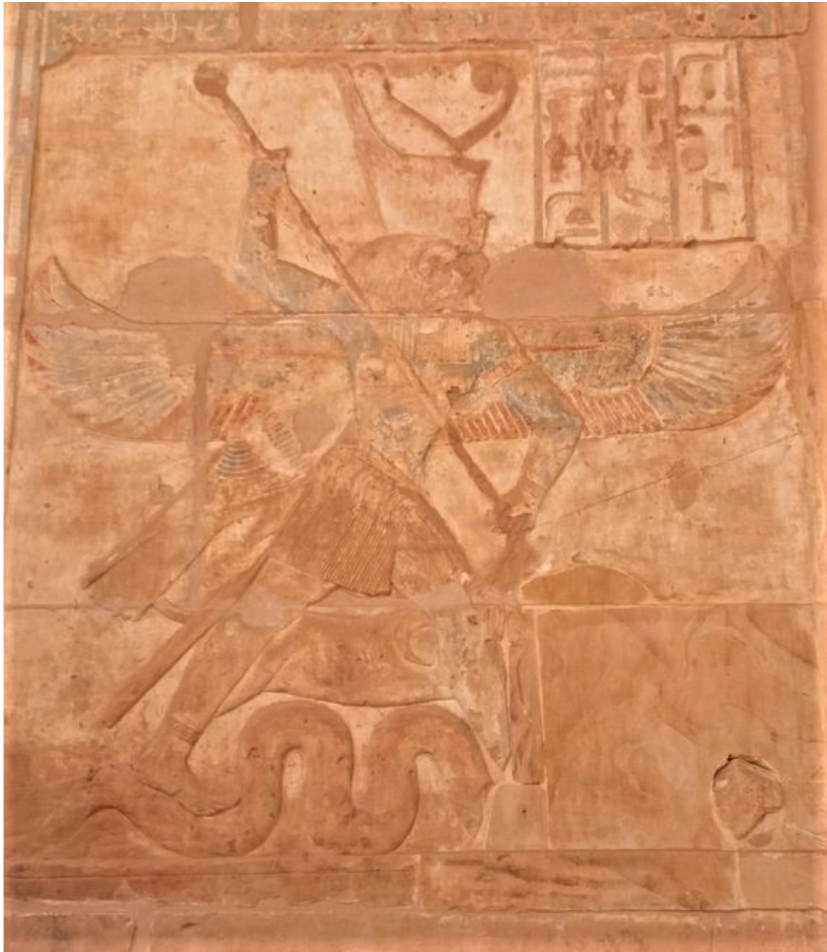
Figure 5. Seth (in the form of a winged, falcon-headed deity) spearing Apophis; Temple of Amun in Hibis in the Kharga Oasis, 27th Dynasty 522–486 BCE. Photo by Iris C. Meijer, 2018 and used with permission.