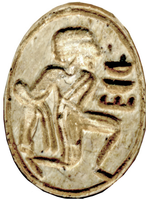
Figure 6. Scarab with bound captive; Egypt, acquired by Henry Walters, 1911, 18th Dynasty ca. 1550 BCE. The Walters Art Museum, 42.10. Open Access CC0 1.0.