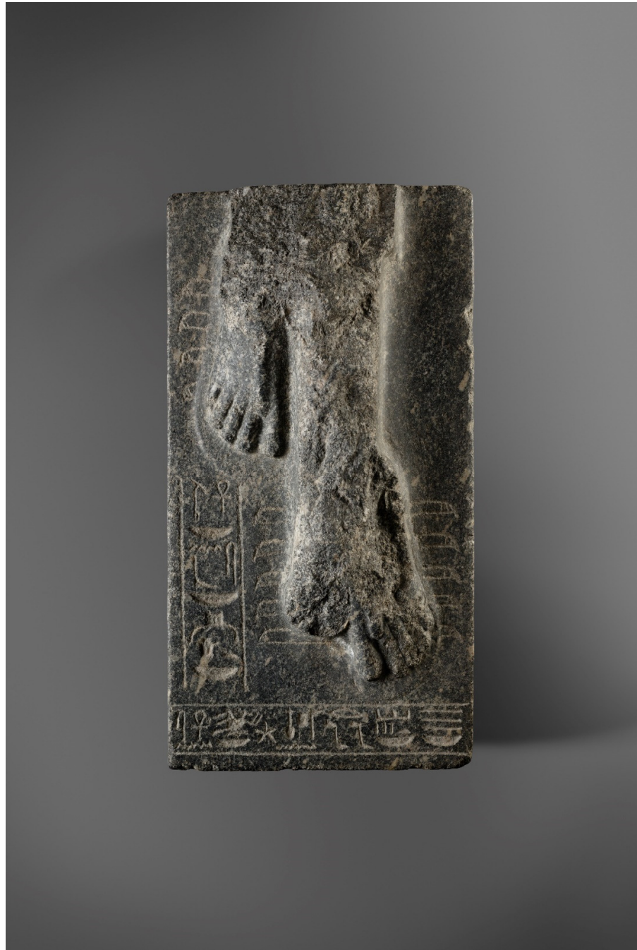
Figure 8. Inscribed base of a royal statue depicting the Nine Bows under the feet of the king; Egypt, 19th–20th Dynasty, ca. 1295–1070 BCE. Metropolitan Museum of Art 56.104. Open Access CC0 1.0.

An abridged version of this bound enemy iconography is that of the Nine Bows, a metaphorical representation of the conceptualized traditional foreign enemy groups of Egypt visualized by a grouping of nine bows. 10 These nine bows were often carved on statue bases and architectural thresholds (see Figure 8). They decorated throne bases, footstools, and the inside of sandals. These icons were meant to be tread upon by the king so that with the assistance of this strategically placed art, he would symbolically trample his enemies.