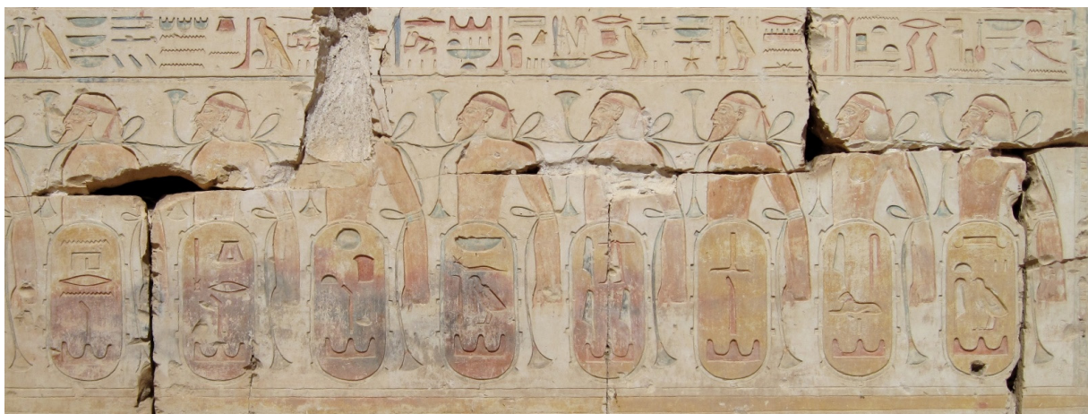
Figure 7. Bound captives in polychrome relief; northwest wall of the Temple of Ramses II at Abydos, Egypt, 19th Dynasty, 1279–1213 BCE.

Images of bound captives are present from predynastic times onward, and they appear on a variety of objects and architectural installations. Most closely associated with royal iconography, images of the king are often nearby or incorporated into the overall vignette, showing that it is the king who has power and dominion over these foreign enemies. Bound captives are often the depicted victim in smiting scenes or shown in orderly rows in images showcasing the aftermath of battle. Sometimes, these figures are labeled as specific foreign enemy groups, as is the case of Figure 7 below. Other times, their dress and adornment may suggest specific foreign origins. Yet other examples, like that of Figure 6 above, show a generic foreign enemy, as the label “ruler of all foreign lands” suggests.