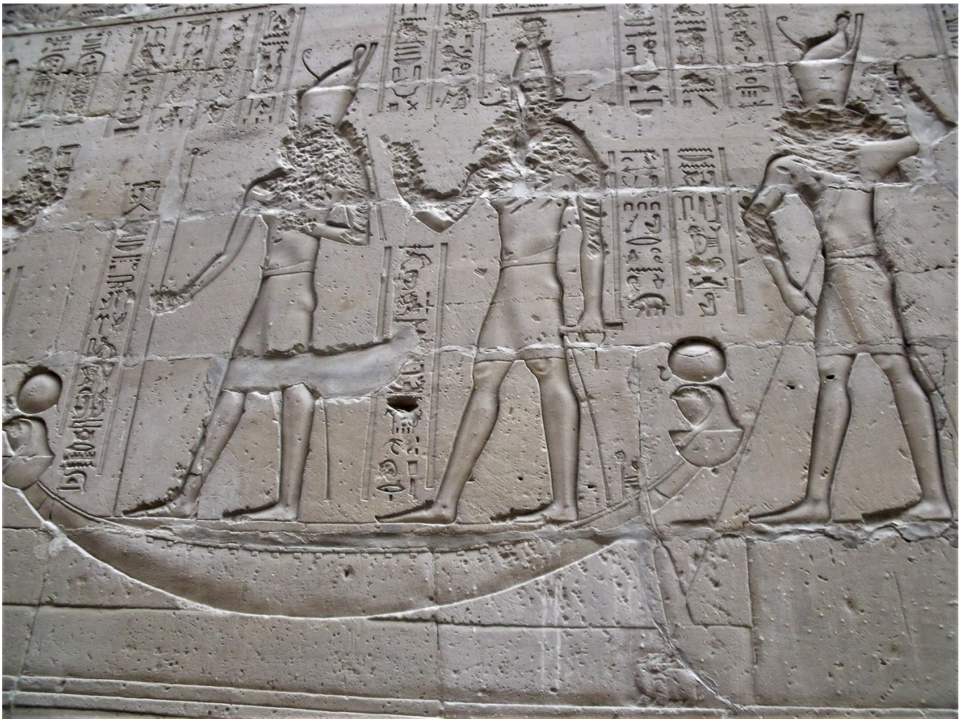
Figure 2. Horus (right) spearing Seth in the form of a hippopotamus; Temple of Horus at Edfu; Ptolemaic Period 237–57 BCE.

The second sub-type of the mythological spearing scene involves Seth not as the target of attack but as the spearer. In the fullest versions of the scene, Seth is shown in the underworld, standing valiantly on the prow of the sun god's solar barque as it traverses the duat (see Figure 3). Every nightly circuit through the duat , the solar barque encounters the serpent demon Apophis, and it becomes Seth's responsibility to slay the serpent, thus protecting the sun god and allowing the safe passage of the solar barque for one more night. These actions result in the universe being able to perpetuate itself and for balance in the world to be maintained. In this single vignette, the maintenance of the entire cosmos is depicted. Therefore, in this version of the spearing motif, Seth is no longer the enemy but the protagonist acting against the threat of Apophis.