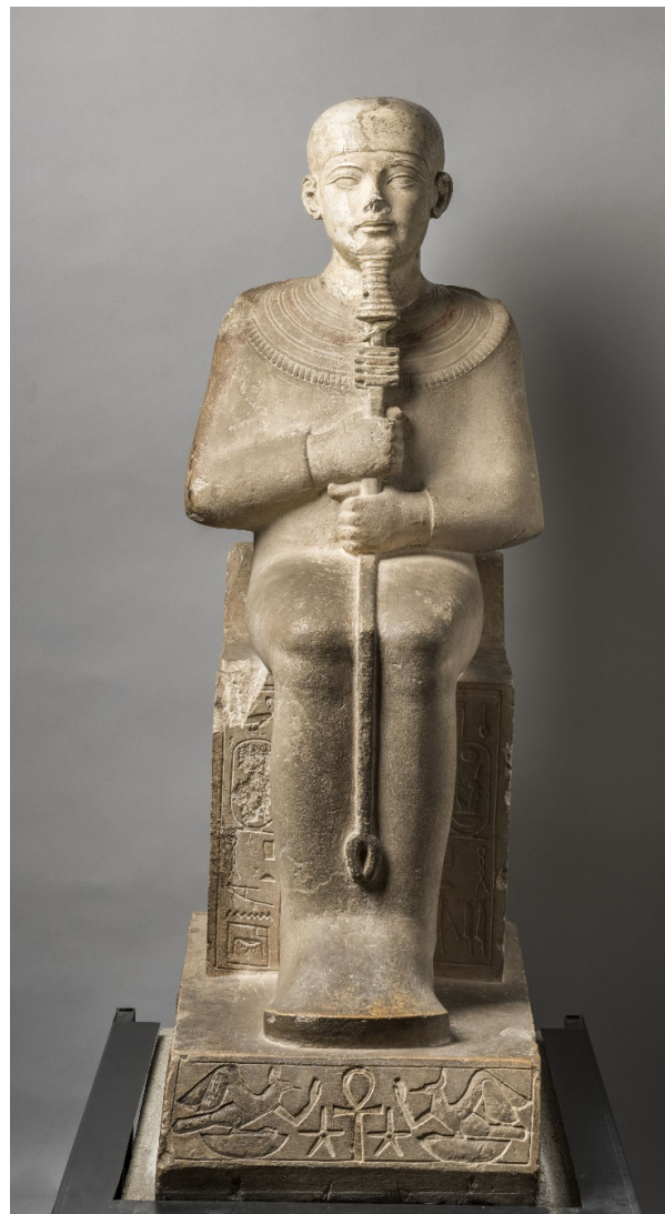
Figure 9. Statue of the god Ptah (the head is a 19th-century restoration) with the rekhyt rebus on the base; Karnak, Egypt, 18th Dynasty, reign of Amenhotep III, 1386–1350 BCE; Museo Egizio Drovetti collection, 1824, Cat. 87. CC BY 2.0.

As time went on, however, the meaning of the rekhyt bird shifted. As the two lands of Upper and Lower Egypt were unified and the peoples who inhabited these lands followed suit, the rekhyt bird came to symbolize all of the common people of Egypt. That is not to say that they were uplifted entirely from their position of subjugation. Images of the rekhyt bird on bases of statuary and on floor tiles endured throughout the timeline of pharaonic Egypt. 13 However, a new version of the rekhyt bird showed the bird as part of a rebus, seated upon a nb basket, meaning “all”. The bird now had a pair of outstretched arms in a posture of worship, and the five-pointed star next to the bird also indicated a meaning of reverent praise (Griffin 2016), as seen on the statue base of Figure 9. This rebus, according to John Baines, symbolized the people of the Egyptian mythological cosmos and excluded non-Egyptians (Baines 1996, pp. 371–72).