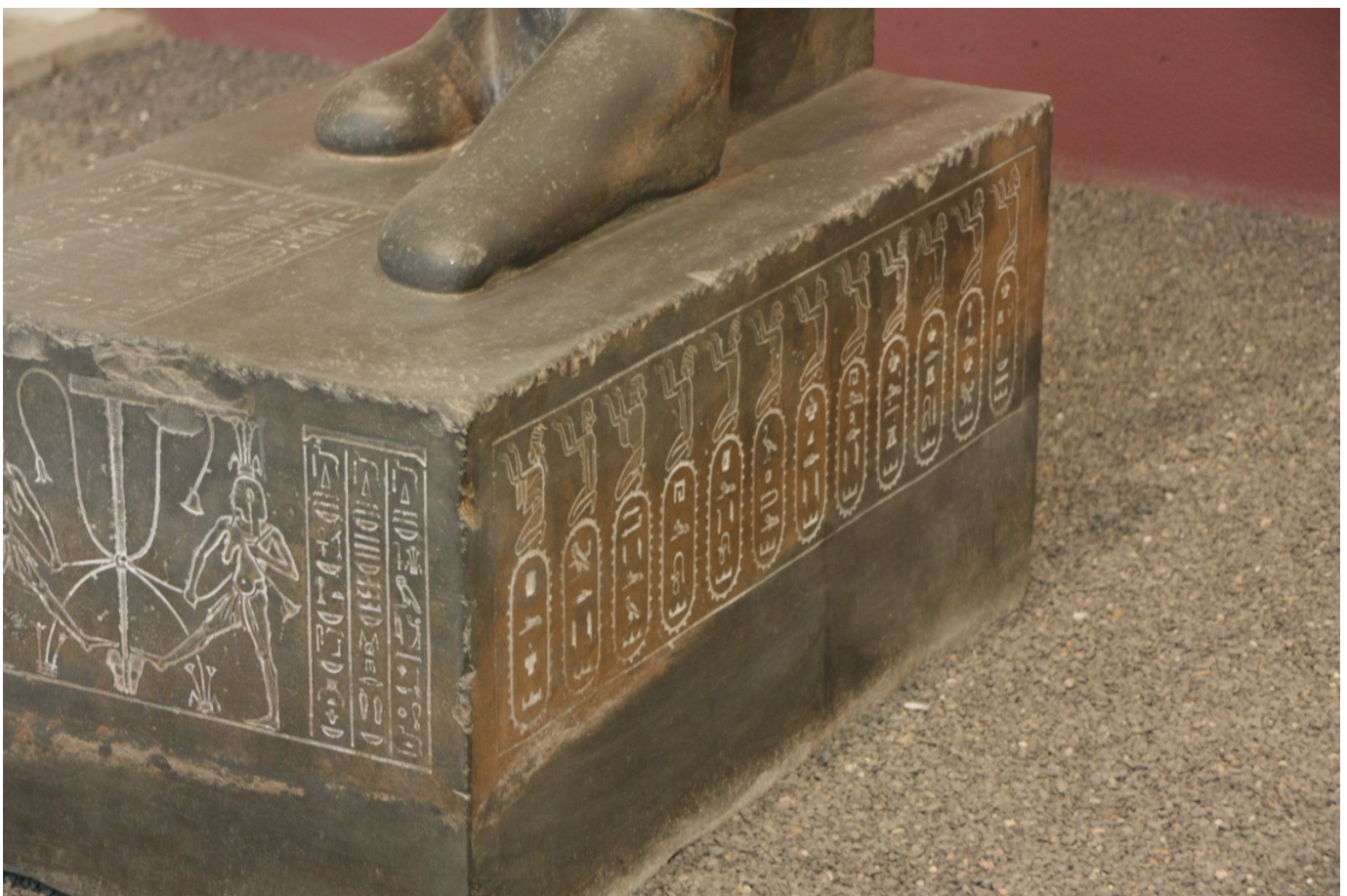
Figure 10. Detail of Darius I statue; Susa (Iran), 6–5th century BCE; National Museum of Iran, MNI inv. n° 4112; photo by Davide Mauro, 2016, CC BY-SA 4.0.

The Achaemenid administration, it seemed, blended the concepts of the bound captive and rekhyt bird and utilized the power of this hybridized image in a new way. A famous statue of Darius I was found in 1972 in the Apadana of the Palace of Darius in Susa. This now-headless statue of Darius I shows the striding king in Persian dress while holding a more artistically Egyptian posture. Inscriptions in Old Persian, Elamite, Babylonian, and Egyptian hieroglyphs 14 provide the titles of the king and explain his orders for craftsmen to create and erect the statue in Egypt (most likely a temple in Heliopolis). The back pillar and the iconography of the sema-tawy motif are explicitly Egyptian in style. On the two long sides of the statue base are representations of twenty-four oblong fortresses with a human figure kneeling in a pose of veneration and support above. These figures (see Figure 10) are labeled with hieroglyphic toponyms and represent the twenty-four subject nations of the Persian empire (Myśliwiec 2000, pp. 146–55; Kuhrt 2007, pp. 477–82; Colburn 2020, pp. 153–58; Qahéri 2020, pp. 64–70).