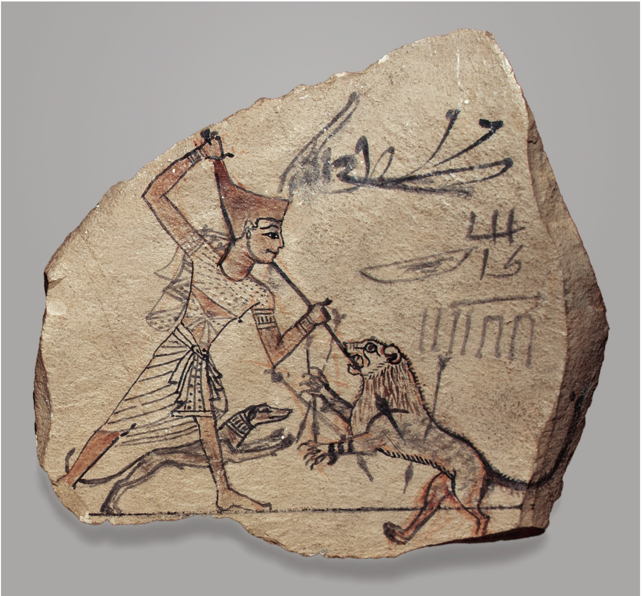
Figure 1. Ostrakon with Pharaoh Spearing a Lion and a Royal Hymn on its Back; Tomb of Tutankhamun (KV 62) (debris near the entrance, Carnarvon/Carter excavations, 1920), Valley of the Kings, Egypt, 20th Dynasty, ca. 1186–1070 BCE; Metropolitan Museum of Art 26.7.1453. Open Access CC0 1.0.

There are two sub-types of mythological spearing scenes. The first shows either Horus or the king (ideologically interchangeable) spearing Seth, most commonly in the animal form of a hippopotamus (see Figure 2). This version of the mythological spearing scene is a visual reference to mythological tales, such as the Contendings of Horus and Seth , where the two titular deities battle for the throne of Egypt. 4 In one challenge, Horus and Seth transform into hippopotami and fight (or have a breath-holding contest, depending on one's interpretation) in the Nile. Isis, in an attempt to aid her son in his quest for the Egyptian throne, constructs a magic harpoon and tries to spear Seth as a hippopotamus. After first hitting her own son, she is then successful in spearing Seth. This tale is most likely the mythological precedence for portraying Seth—a volatile god whose name and image are often too dangerous to depict outright—as a hippopotamus in artistic renderings.