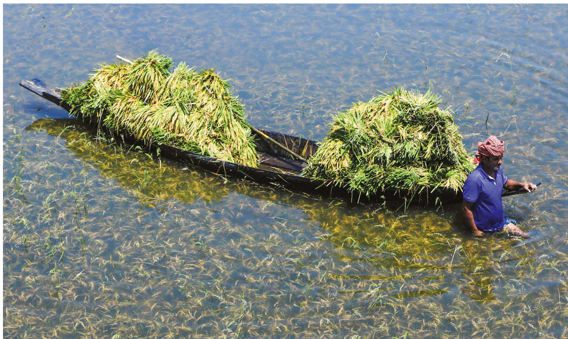
A farmer in Sunamganj, Bangladesh, moves harvested rice by boat after rains triggered flooding.

In high-impact, non-specialist journals such as Nature or Science , the problem might stem from editors not having enough contact with specialists in crop breeding and quantitative genetics — scholars who are trained to critically examine field-based experiments and yield trials. Papers in these journals tend to devote just a few sentences to the results of greenhouse experiments or small-scale field trials. The reviewers are more likely to be molecular biologists or geneticists, and to focus most of their attention on the main contribution of a paper — often the molecular-biology changes caused by a genetic improvement.