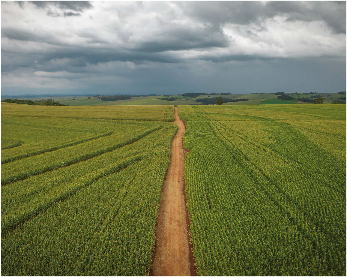
Maize fields near Londrina in southern Brazil.

Although single genes can affect yield, such genes always operate in conjunction with soil and fertilizer management regimes, the hundreds of other genes involved in crop domestication and adaptation, and so on. The drastic increase in crop yields and agricultural production of the Green Revolution, for instance, stemmed from the introduction of the gene variants Rht-B1 and Rht-D1 into wheat and sd1 into rice, in combination with greater use of synthetic fertilizer. These variants shortened the plants, reducing their susceptibility to damage in high winds.