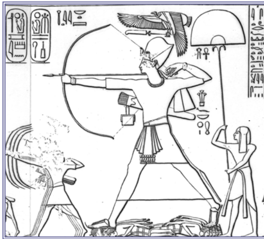
Figure 4. sryt military standard held over Ramesses III. Dynasty 20.