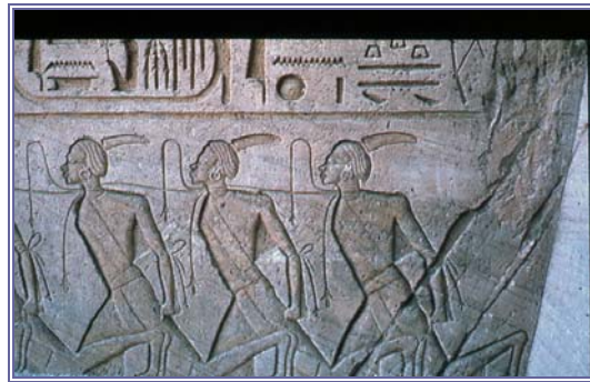
Figure 6. Bound Nubians with a feather on their heads. Abu Simbel. Dynasty 19.

Semi-circular feathered fans on long handles (fig. 3) were held over a divine presence or a divine intermediary to proclaim its presence in processions and festivals (Bell 1985). The phonetic value for “fan” was the same as for shade ( šwt ). In the New Kingdom, šwt became synonymous with the presence of the god, for example, “the shade of Ra had come to rest upon it” or the god’s shade “being upon his head” (Bell 1985: 33). A similar feather fan ( sryt ) served as a military standard for the army and navy (fig. 4; Faulkner 1941). A tall slender fan ( bht/hw or hwyi ) of a single ostrich plume accompanied the king or members of the royal family (Davis 1907: pl. 36) as a sign