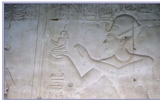
Figure 1. The goddess Maat, wearing an ostrich plume ( mꜣt ) on her head, being offered by Sety I. Abydos, temple of Sety I. Dynasty 19.

Feathers in Religious Iconography and Hieroglyphic Writing