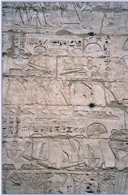
Figure 3. shw fan over the barques of Khons and Mut denoting the presence of the divine images. Medinet Habu. Dynasty 20.

personification of the West (Seeber 1976: 143 - 144, figs. 23 and 24). In some vignettes of Chapter 125 of the Book of the Dead , the judges