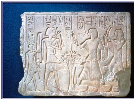
Figure 5. Fan ( bht/hw ) held by prince Ramesses behind his father Sety I. OIM 10507. Dynasty 19.

the feathered wings of the deities Nekhbet and Wadjet encircle the shoulders and chest.