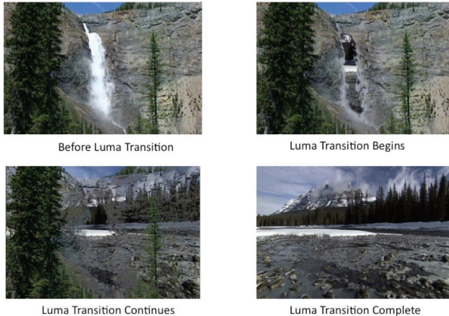
Figure 2: Stages of Luminance Transition